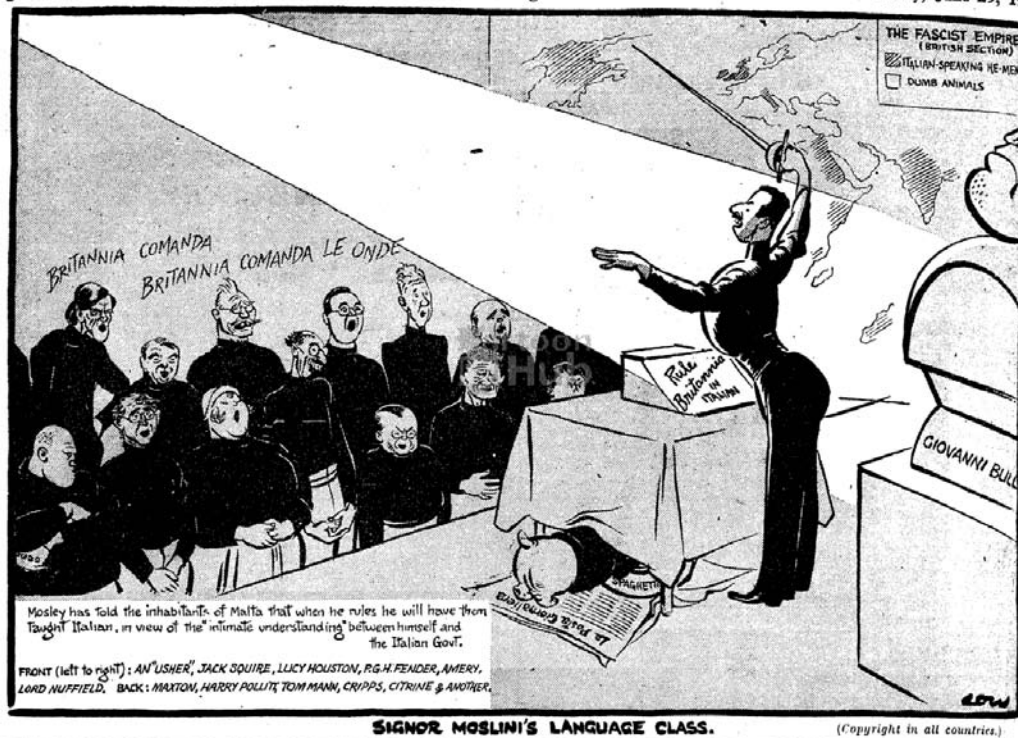
"Signor Moslini's Language Class": David Low's cartoon from The Evening Standard, June 29, 1934, mocks the enthusiasm of the British elites for a Fascist Empire. At the podium is Sir Oswald Mosley.

in was his outlook on the European problem generally. On this he talked what seemed to me vigorous commonsense. . . .