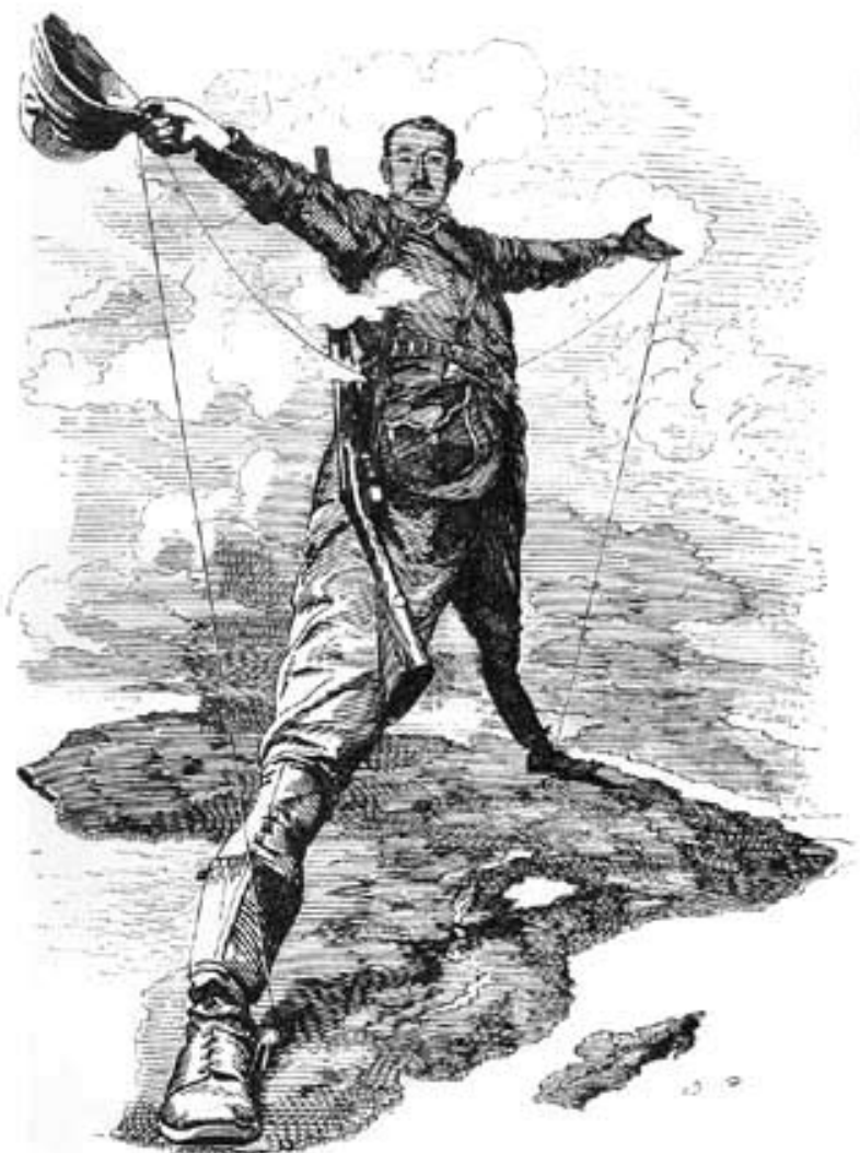
Sir Cecil Rhodes wrote that the aim of his proposed secret society was “the extension of British rule throughout the world,” especially Africa, the Holy Land, and the Valley of the Euphrates. Leo Stennet Amery, one of the masterminds of Britain’s Zionist project, walked in Rhodes’ footsteps.

system of securing cheap raw materials from colonized, backward parts of the world, and shipping them back to England for industrial production and military use.