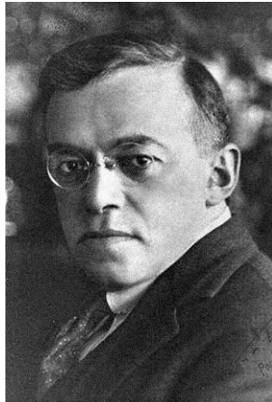
Vladimir Ze’ev Jabotinsky in 1937: “I believe in England, and the brotherhood between England and Israel.”

By and large, they shared the aims of Rhodes’ Will. They had one major enemy, the American System of Political Economy. It threatened the existence of the British Empire, which depended upon a mercantilist