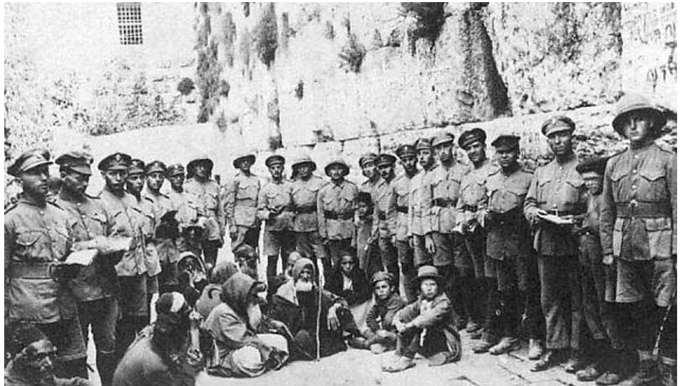
The Jewish Legion in Jerusalem after the British takeover of the city in December 1917. The Legion's creation was a British project, opposed by most Jews. After the war, it became a deadly weapon used for confrontation with the Arabs of Palestine.