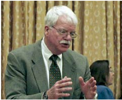
House Committee on Education and Labor