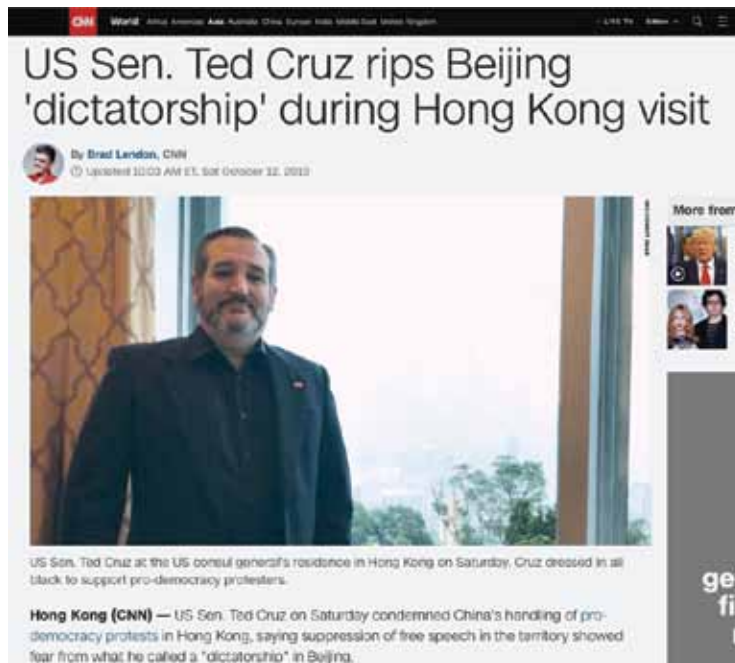
Sen. Ted Cruz, dressed in black in Hong Kong to "show solidarity" with anarchists killing and burning down the city

These operations against China and the Chinese do not stop at legal and political harassment. The mass