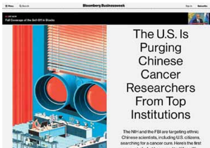
Bloomberg Business and the American Association for the Advancement of Science cover the FBI purging of leading Chinese-American scientists

It is shocking, but not surprising, that the same institutions—especially the corrupt FBI—that have carried out the failed coup attempt against President Donald