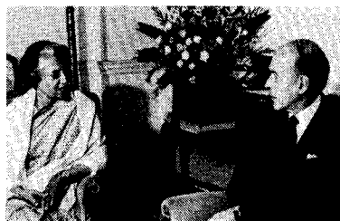
France's President Giscard d'Estaing and India's Prime Minister Indira Gandhi meet at the Presidential Palace in New Delhi, Jan. 25.