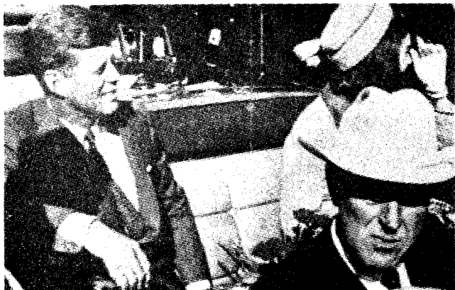
No one thought Oswald was a loner. Therefore 'crazed' assassins were created.