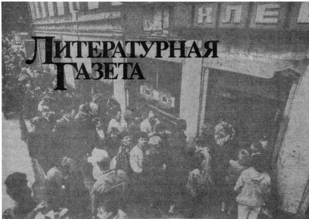
“Under massive Anglo-American pressure, ultra-liberal ‘shock therapy’ was implemented in Russia, leading inevitably to mass pauperization, deindustrialization, and hyperinflation.” The Aug. 11 Literaturnaya Gazeta, a Russian weekly, showed this line at a bread shop.

remains the least bit Russian. And, if this be so, it means that Russia is something independent and particular, not resembling Europe at all, but important by itself. . . . Every great people, if it wishes to live long, believes that it and it alone harbors the salvation of the world — that it only lives in order to stand at the head of all peoples, to assimilate them into itself, and to lead them.” The Third Rome matrix signifies a world-view in Russia which not only emphasizes the “otherness” of Russia vis-à-vis western Europe, but which invests Russia with an inherent, quasi-messianic superiority over a decaying, historically doomed West. It expresses itself in a rather undifferentiated, sometimes simmering, sometimes open hostility against “the West.” The Third Rome matrix is based on the Byzantine model of an all-dominating state, and emphasizes the collective over the individual.