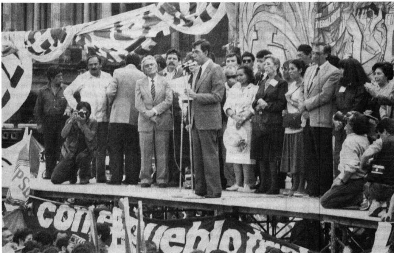
Cuauhtémoc Cárdenas speaks at an election rally during the 1988 presidential campaign. At that time he attacked the International Monetary Fund and spoke of problems caused by payment of the usurious foreign debt; today, these themes have been abandoned, as he falls into step with the Anglo-Americans' new world order.

lowers to cultivate a self-image as a “demi-god,” and despite the fact that his seven months in office proved him to be an authoritarian who encouraged the use of terrorism against his political opponents. One of the terrorist methods promoted by Aristide is the so-called “Père Lebrun,” or “necklacing”—that is, chopping the arms of the victim off, hanging a gasoline-filled tire around his neck, and setting it aflame.