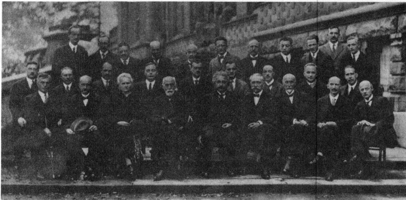
The fifth Solvay Conference in 1927. Participants in the Solvay Conferences denied the feasibility of a nuclear fission chain-reaction—until Bertrand Russell and company decided to induce President Roosevelt to build an atomic bomb. Among the participants are: (front row) second from left, Max Planck; third from left, Marie Curie; fifth from left, Albert Einstein; (middle row) far right, Niels Bohr; (rear) sixth from left, Erwin Schrödinger; ninth from left, Werner Heisenberg.