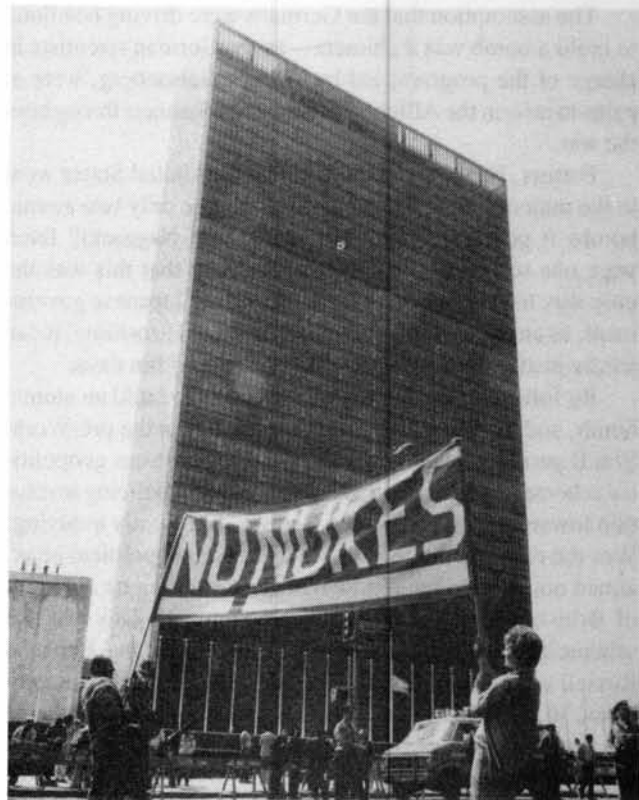
A demonstration at United Nations headquarters in New York City in 1982. The ban-the-bomb movement was created by Bertrand Russell in order to terrify nations into surrendering their sovereignty to a U.N. world government.

These facts are well known to Teller and Bethe. If they were serious in refuting Sudoplatov's Chapter 7, they would point to these facts, and show what sort of hoax Sudoplatov's book is written to perpetrate, and why. Perhaps if they were willing to face openly the truth about the Solvay Conferences and a few other bits of very dirty laundry in the internal life of science, they would have cultivated a stronger sense of the importance of strict truth in the domain of politics. I suppose we must be satisfied that Ed Teller did the decent thing by Enrico Fermi.