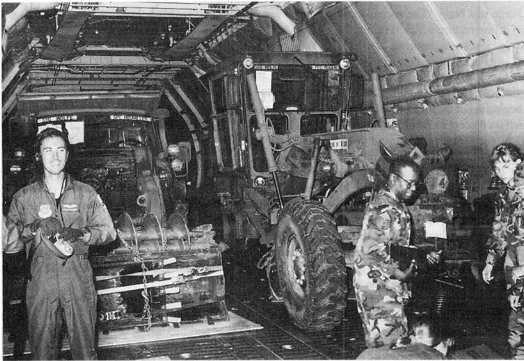
The C-5B Galaxy transport plane is loaded with construction and drilling equipment on Aug. 3, at the Rhine Main Air Base in Frankfurt, Germany, preparing for the trip to Goma, Zaire.

purification equipment of the U.S. Army and the San Francisco Fire Department was loaded onto long-range, heavy transport aircraft in the United States and flown to Goma. In the evening of July 25, the water purification facilities began to produce approximately 200,000 liters of fresh water a day. Since then, together with German water purification equipment flown to Goma by the U.S. Air Force, the fresh water output has been increased to approximately 1.5 million liters per day. It is an indisputable fact, that this operation has saved the lives of at least 500,000 Rwandans, who would have died of cholera in the last week of July and the first days of August.