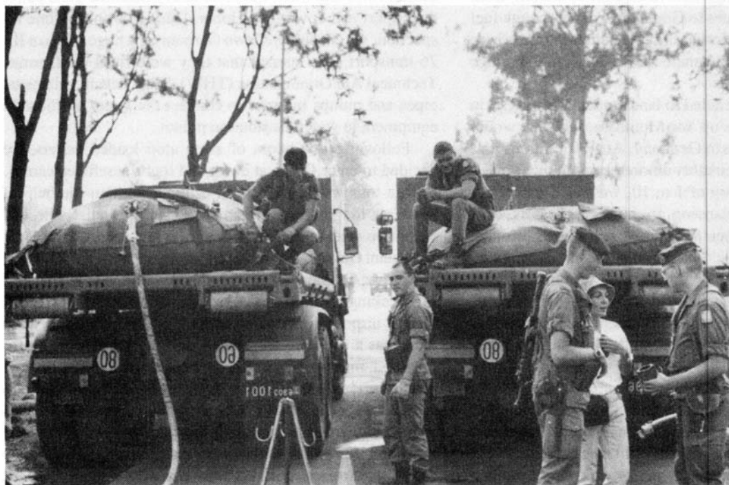
A French Army tanker truck draws water from the American Army-run water purification station in Goma, Aug. 4, 1994.

We had the opportunity to visit the central water purification and pumping station. It is located in downtown Goma, on the banks of Lake Kivu. The station was set up and is operated by the U.S. Army, in cooperation with American volunteers from the San Francisco Fire Department and the German THW. French military tanker trucks participate in the water distribution. The equipment was airlifted from the United States, from Germany, and from Diego Garcia, the U.S. island base in the Indian Ocean. The station includes two water purifiers, several chlorinators, and a maze of hoses and rubber tanks. We were surprised to find the main pump was in fact a fire truck, airlifted from northern California. It is operated by a group of Californian rescue workers who use the same truck fighting forest fires in the mountains of