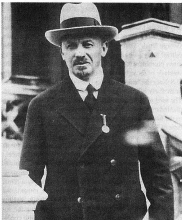
Nikolai Bukharin. The seed of Moscow's current susceptibility to destruction by Margaret Thatcher's "Reform," was planted with the neo-Bukharinist restoration which can be traced to the time of N.S. Khrushchev.

The underlying feature of the role of the Venetian Party in the history of England since 1517, has been the misshaping of England into an instrument of Venice's commitment to wipe the existence of the modern sovereign nation-state from the face of our planet. Since Venice's narrow escape from imminent crushing defeat by France and her League of Cambrai allies, all of the history of European civilization has been governed by the conflict between the ancient oligarchical, imperial tradition, against the insurgency of the upstart modern nation-state republic, as first typified by Louis XI's France, and as best typified later by the U.S. Federal constitutional republic shaped by G. Leibniz's anti-Locke conceptions of natural law, and that that principle was best served under such Presidents as Washington and Lincoln. 44