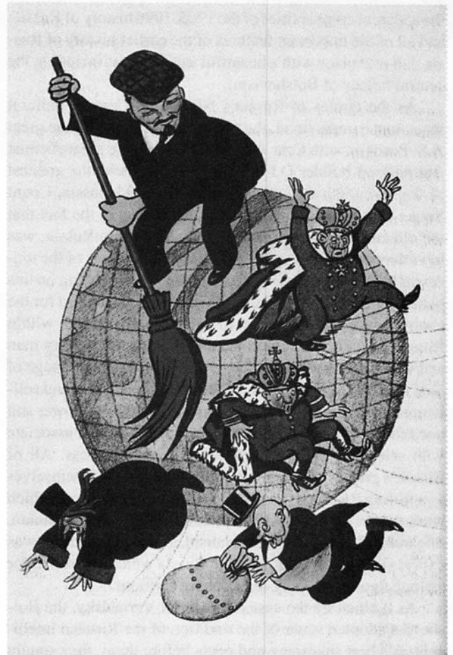
A Communist Party poster shows Lenin sweeping away the old order. Writes LaRouche: "Foolish Nicholas II's Russia hung out the sign for the ice-man: Who would bury the corrupt institutions which had combined their influence, to cause 1914-1917 Russia to destroy itself, by the folly of Russia's pan-Slav alliance with the Anglo-French war-makers? Lenin served as the undertaker."

it from dismemberment earlier. Those patriots would insist that the tale be told fairly, that it be granted, that there were certain achievements, some of heroic dimensions. These patriots would demand, that we tell them, "There must have been flaws, but certainly no worse than those of the rotten institutions of Nicholas II's time. Let us agree to settle these debts to history honorably; what were those flaws, that we might now proceed forward in history, without repeating the errors which brought about the self-destruction of regimes of the past?"