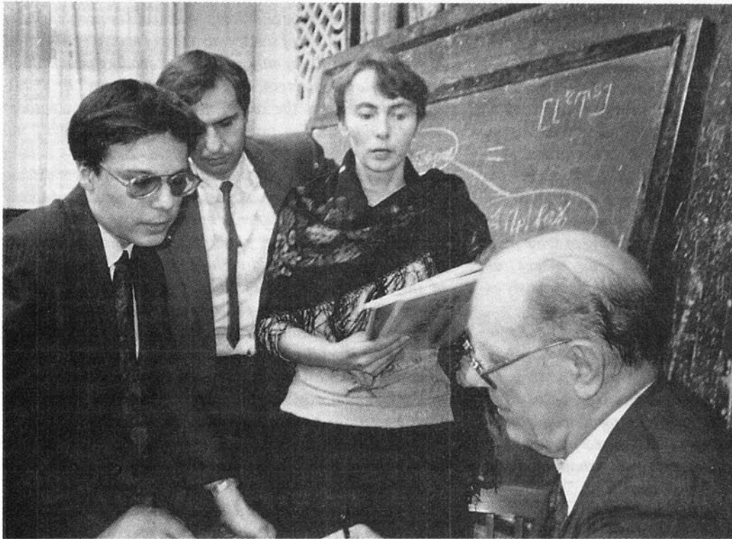
Lyndon LaRouche speaks with people attending his lecture at the Russian Academy of Sciences in Moscow, April 28, 1994. LaRouche's discussions with Russians in recent years, he writes, "have centered around the problems generated by the fact, that, for well-known historical reasons, few of even today's ostensibly well-educated Russians, know the most crucial facts respecting the last three centuries of the history of their nation's relationship to Venice, the British Empire, western continental Europe, and the United States."