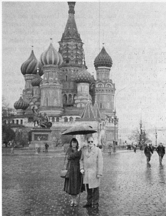
Lyndon and Helga LaRouche in Red Square, Moscow, April 1994.

We come thus to the concluding proposition: How might a literate policy toward Russia today, be crafted by today's, predominantly, functionally illiterate U.S. statesmen? Such a warning points toward the kind of men and women in public life, who, with guidance of pollsters, might have learned to identify the relatively more fashionable opinions of today, but who are either incapable of formulating actual conceptions, or, if they were capable of doing so, do not permit