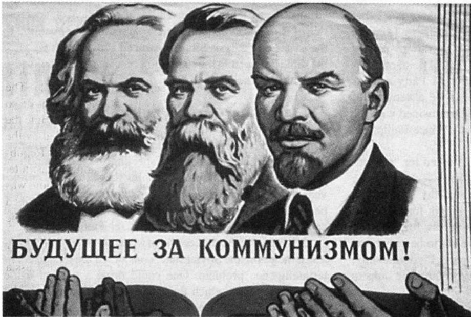
A Soviet poster showing Marx, Engels, and Lenin. The slogan reads, "The Future Is with Communism." LaRouche writes, "The crucial problem of internal political security confronting the Communists, in particular, was that the Communist and related movements were virtually all products of the so-called Enlightenment."

person's loyalty lie? To whom, is one attached; to what, is one committed?