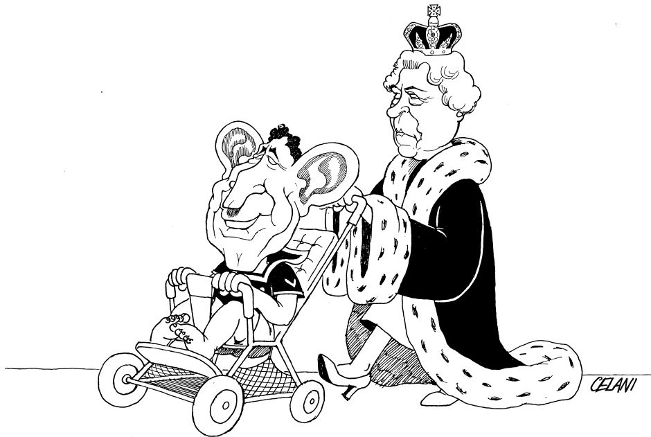
Sometimes, the Queen did push dope!

also of what is often justly best described as a lying U.S. Department of Injustice, and even of all too many fraud-reeking occupants of Federal Court benches. The case of Princess Diana, the mother of putative heirs to the British throne, is of exceptional importance for the cause of justice in the world at large today.