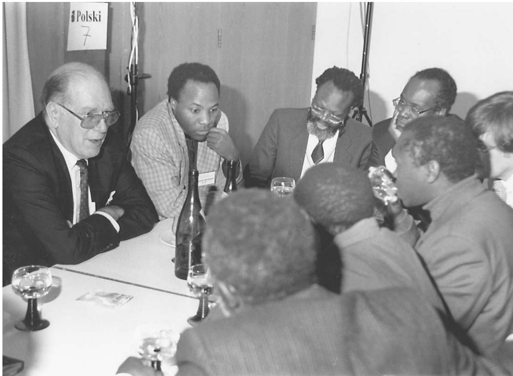
Lyndon LaRouche meets with an African delegation in Germany.

ally.” What is most critical, he said, is the “sustained business” of LaRouche making “pronouncements and advertisements” about “the extent of the crises” in the financial and strategic realms. “This is really a reasoned alternative in the world, a point of reference. . . . I see it working by osmosis. LaRouche’s interventions and perspectives seep through. We can clearly see that there are alternatives. I would call this is a ‘second constituency,’ against the rubbish about the market economy that we hear. The fact that this has been initiated, and is making progress, with national and international momentum, is what is important.”