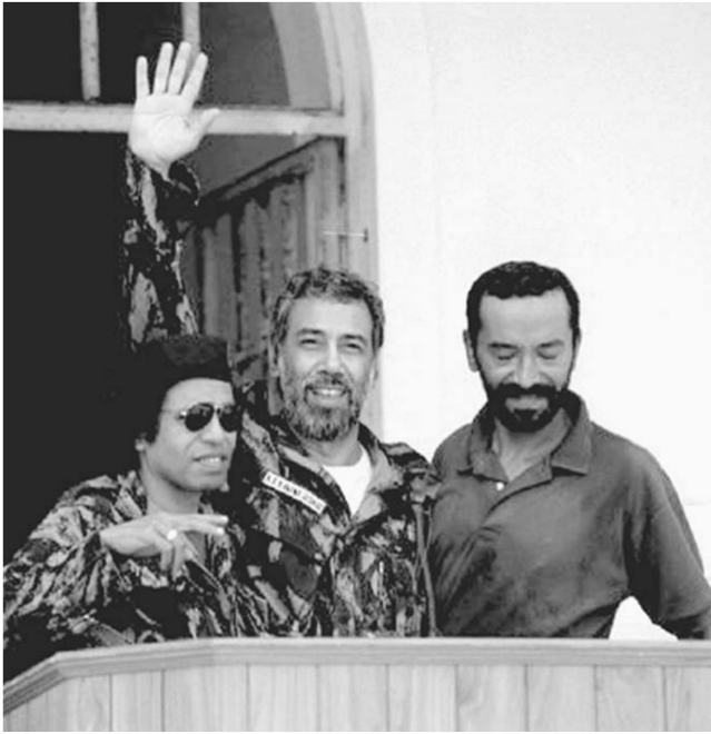
“The emerging micro-state of East Timor,” writes LaRouche, “has no prospective viability as a national entity. It is a pitiable ghetto, with no decent future prospects under a continuation of these circumstances.” Here, Xanana Gusmao (center), leader of the East Timor independence movement, gives a speech upon his return to the capital city of Dili.

For this, I need—and your country needs—citizens who are willing to think seriously, once again, about sometimes frightening, but urgent personal, national, and global issues.