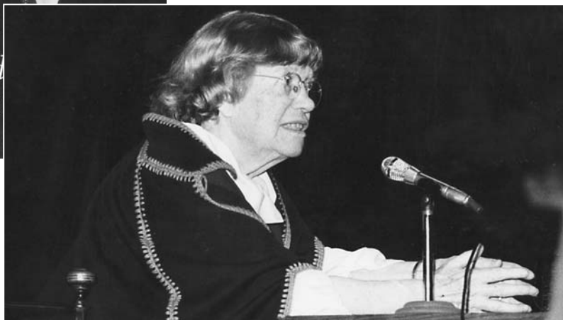
Among the creators of the techniques of mind control that led to the current explosion of programmed violence (clockwise from left): Margaret Mead, Aldous Huxley, John von Neumann, Bertrand Russell.