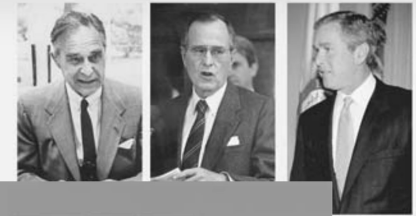
he played a role in putting

Democratic pre-candidate Lyndon LaRouche... conference in Concord, New Hampshire... of George "Jefferson Davis" Bush... flag is an indicator of a fundamental quality... more upholding General Welfare... nation. LaRouche explained that both Bush... without regard inside the Democratic Party... rights and the 1965 Voting Rights Act, an... LaRouche off the ballot South Carolina for... have a common racist outlook that... future of the United States.