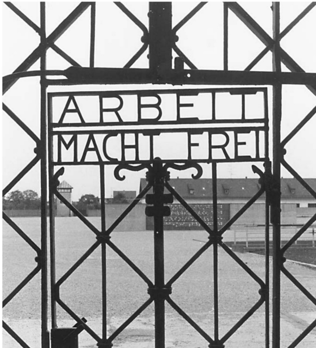
The Dachau concentration camp. Why did Hitler kill the Jews? Josef Goebbels summed it up: Hitler's Germany could never forgive the Jews for having given birth to Christianity.

ernment from instituting the urgently needed reforms required by the follies of Versailles.