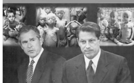
is the victims and perpetration of family maintenance and business, but they are not mothers, except for one." In other words, there... "The Bush dynasty is... across screen depiction of... a horror film. "The Texas... kind of... South by the... 1999

AIDS: The Deliberate Catastrophe Wall Street Wins Mexico's Presidential Election LaRouche Battles Gore for Soul of Democratic Party LaRouche: Call Them 'The Baby Doomers'