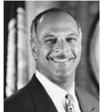
Mayor Bill Campbell

A naive citizen, relying on the stream of media reports that began appearing nationally sometime in late September, might conclude that Atlanta’s two-term Mayor Bill Campbell is suffering some kind of mental breakdown. Articles reported that he was “lashing out in a paranoid and vituperative fashion,” when he charged that a Federal probe into possible government corruption in his city was racially motivated. Some said he was “playing the race card” (Mayor Campbell is African-American), and threatening to incite a race riot if Federal investigators didn’t back off.