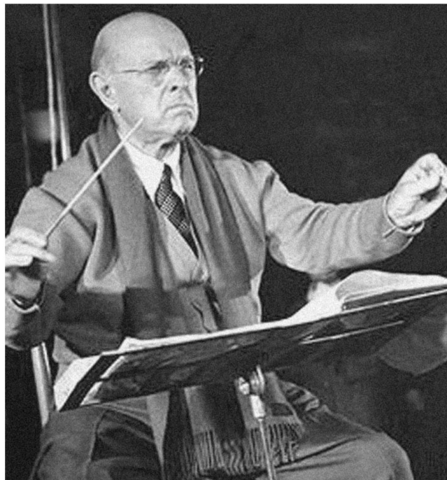
Pablo Casals, who would sing as he played, either aloud or "under his breath." "Phenomena of this type reflect the importance of a singing form of vocalization of poetry, in enabling the faithful transmission of ideas through oral traditions, over many succeeding generations."

This does not support what is often identified with "phonetics," in educational practices today. The relevant distinction will become clear as we proceed. What I am addressing here, is not tricks, but, rather, deep principles of the individual human mind.