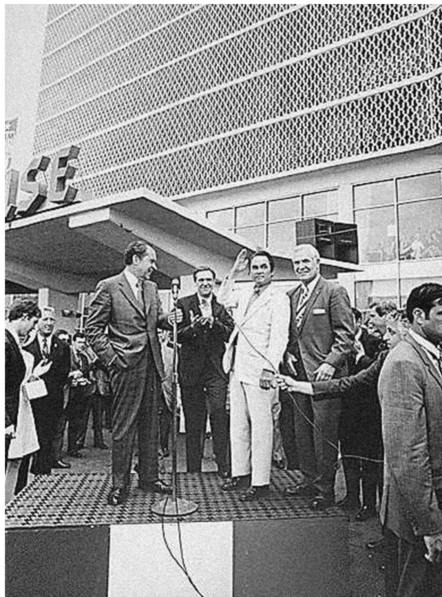
The GOP's Southern Strategy: President Nixon (left) in Alabama, with Gov. George Wallace (in white suit), May 1971.

predetermined to occur, but which will be the result of the free-will choice of the pathway to the future which a people, a nation, a culture may select. What can be forecast, is the likely outcome of a particular choice, including a failure to make an available choice. That decision, or non-decision will determine what confronts the people who have chosen one of those selections. As the world's most successful of the documented long-range forecaster of recent decades, I may personally assure you, that we may, and must forecast the likely choices, and their consequences, including the terrible consequence which a people will choose, as long as they cling foolishly to certain axiomatic-like cultural and related assumptions, such as the assumptions of what has become increasingly prevailing U.S. popular opinion since about the time of President Nixon's adoption of his "Southern Strategy" and neo-liberal dogmas.