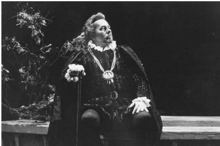
"The attempt to interpret the written word as merely written word," writes LaRouche, "falls into a fatal intellectual trap: can one dare to ignore that passion, expressed as action and vocalization, which is essential to the meaning of the utterance, and adduce the intent of the utterance merely from a ritual examination of the written text?" Here: Verdi's opera Don Carlo is performed by the Baltimore Opera Company, with King Philip II (left), Don Carlo and Elisabetta (right).