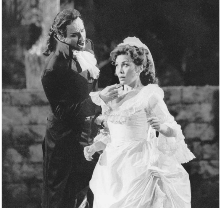
“The essential quality of intelligent communication, is the speakers’ reliance upon the impact of the unexpected upon the mind of the audience.” Here: (left) Rigoletto and his daughter Gilda , in a production of Verdi’s opera Rigoletto by The Washington Opera; (above) Don Giovanni and Zerlina , in the same opera company’s production of Mozart’s Don Giovanni .

the audience. The term “definitive performance” should be outlawed from any other use, but that of indicating the successful realization of those requirements.