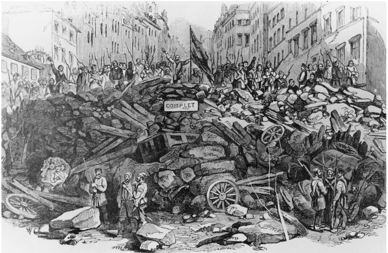
“Opposite to the Classical impulse, the terrible reaction which sent Europe almost back to feudalism, during the first half of the Nineteenth Century, reflected the resurgence of Romanticism brought about through the widely radiated, successive impacts of the ‘Nuremberg-Rally-like’ circuses of 1789-1794 Jacobin Terror and Caesar-modelled Napoleonic succession, in France.” Shown here is a mob storming a barricade in Paris during the Revolution.

political parties or candidacies, mimics the slave competing for handouts at the back door of the slave-master’s big white house. The slave is thus controlled more effectively in this way, as today’s voters in the recent national election were controlled, as efficiently, in net effect, as by a uniformed Gestapo . The shackles they wear on their minds, are, thus, those they place dutifully upon themselves.