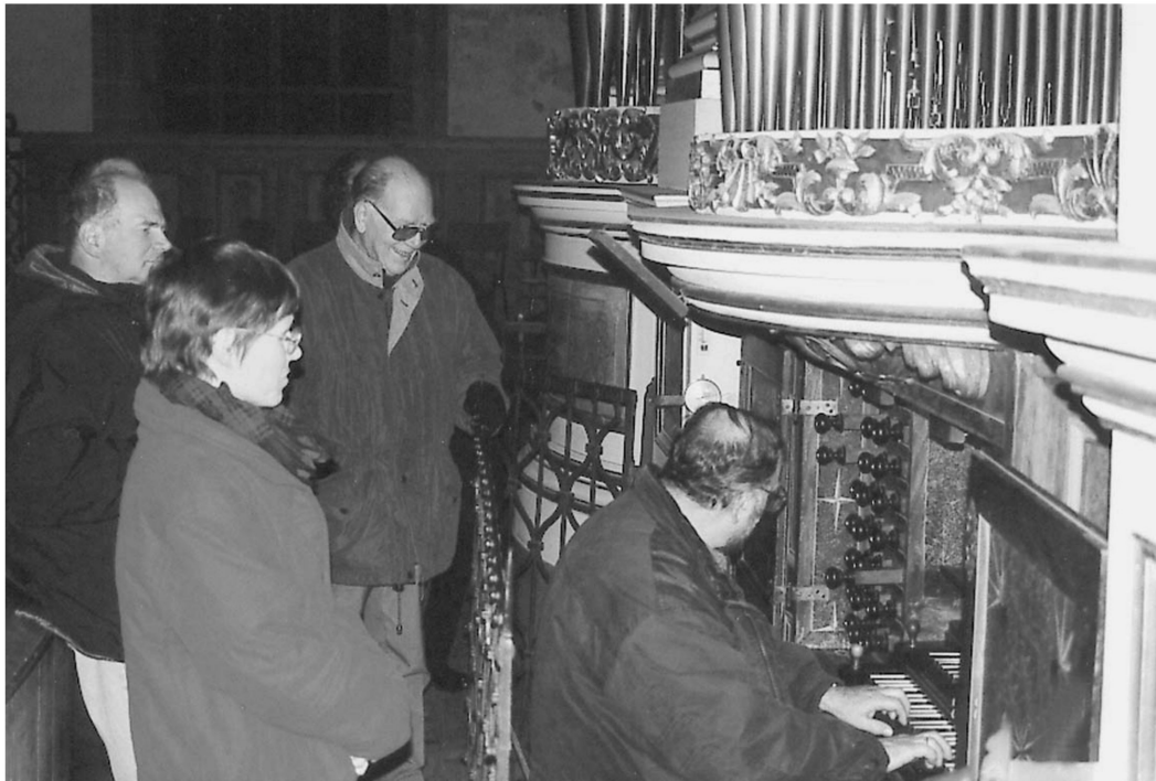
Lyndon LaRouche (third from left) visits the cathedral in Freiberg, Germany on Nov. 20, during a tour which also took him to the opera in nearby Dresden. The organist demonstrates the cathedral's large Silbermann organ.

vated the same secret police to deploy Schindler, for example, as a subsequently exposed spy against Ludwig van Beethoven.