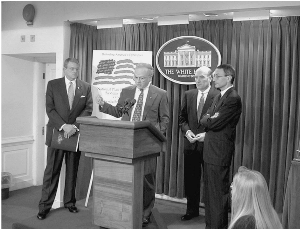
National Coordinator for Security, Infrastructure Protection, and Counter-Terrorism Richard Clarke (at podium), with Commerce Secretary William Daley and John Podesta, White House Chief of Staff.

fact that this might cause a further fractioning of Russia, which is something that she has publicly stated, she believes will occur; 2) Rice is a genocidalist, who would reverse President Clinton's May 10, 2000 Executive Order barring U.S. sanctions against AIDS-devastated countries that produce generic anti-AIDS medications, on the basis that such pandemic diseases constitute a national security threat; 3) recognizing that millions of North Koreans are starving to death, she would withhold aid, and has sought to put the brakes on South Korean President Kim Dae-jung's "Sunshine Policy" for North-South rapprochement; 4) Rice stresses that President Clinton was wrong in calling for a "strategic partnership" with China, and claims that conflict between the United States and China is almost inevitable; and, 5) Rice is a outspoken advocate of all things British, including its Hobbesian policy of "balance of power," to ensure Anglo-American hegemony by pitting each against all.