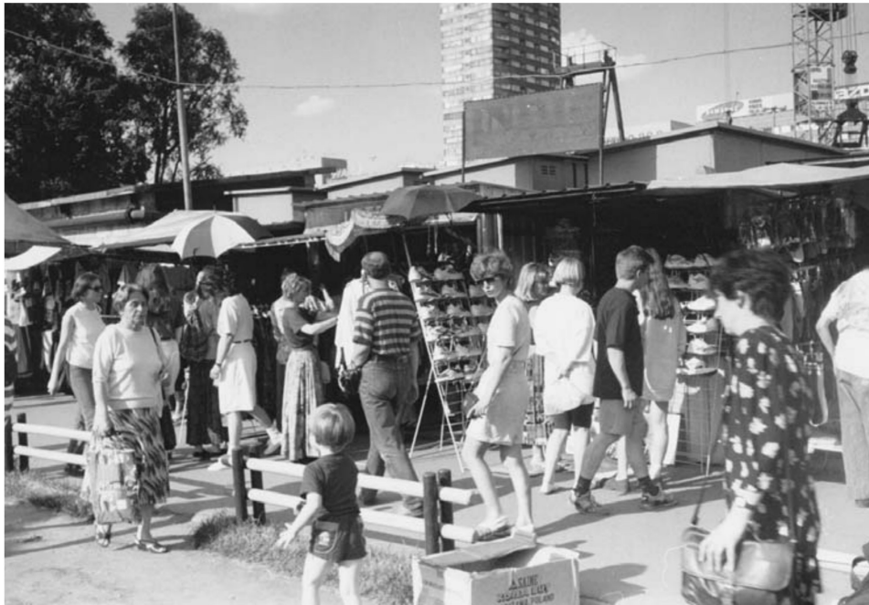
Instead of development of the real economy, Poles got the IMF's "my money" economy instead, reflected in a brief "consumer boom" for a small segment of society during the 1990s. "Free market" meant flea market, as here in the Warsaw city center in 1995.

history on the other side, in East Asia and South Asia.