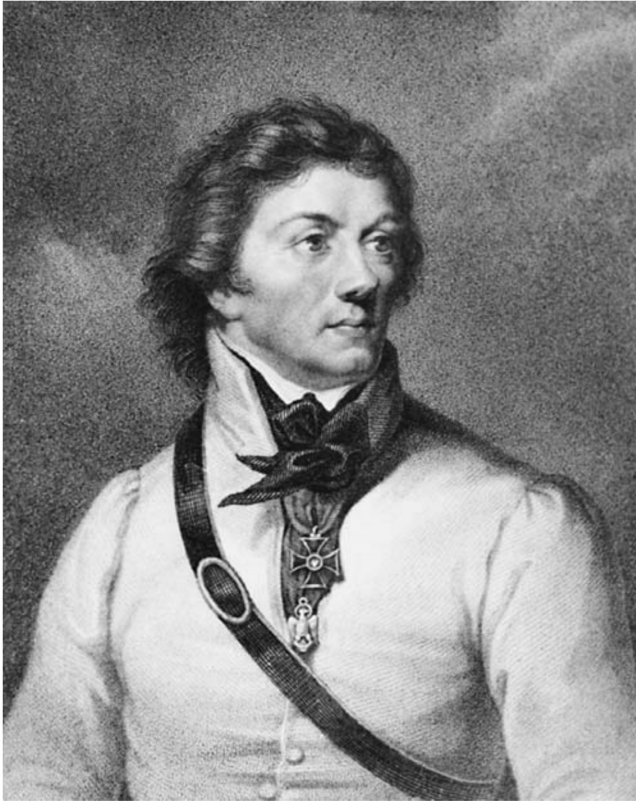
Keep fighting until we win “is an old Polish custom. That’s why Poland exists.” Thaddeus Kosciuszko, the most world-famed of Polish national liberation fighters, led the uprising of 1794 against Russian rule, and was a key collaborator of Gen. George Washington in winning the American revolution.

which is not exactly fruitful for human habitation, including Central Asia, and even the tundra areas of North Asia, will become areas in which the natural resources which lie in those areas, would now become economically accessible to the nations as a whole.