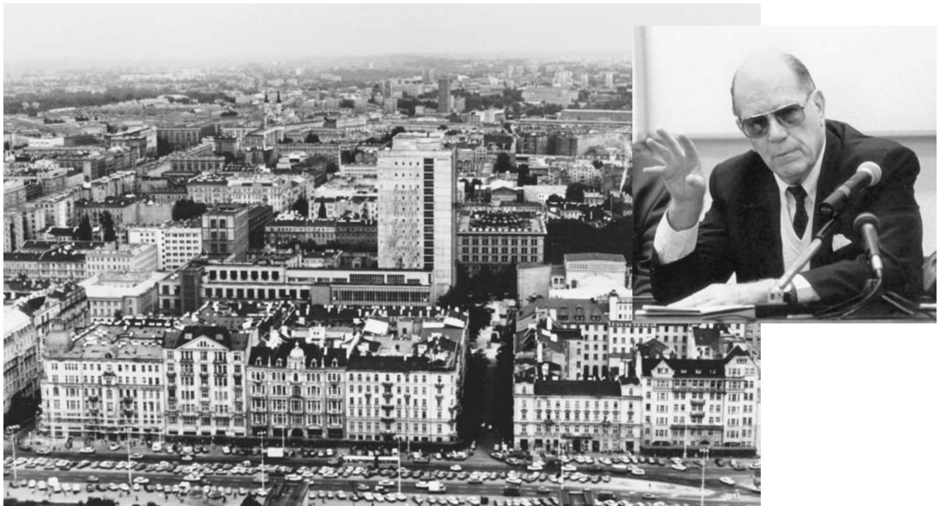
City center buildings and Cathedral of Warsaw in 1989, when Poland was breaking free of Communist rule and had not yet come under the IMF's disastrous economic dictate. In that year, Lyndon LaRouche (inset, speaking in Warsaw) first proposed East European reconstruction led by extending high-speed rail, energy, and communications corridors through Warsaw—the beginning of LaRouche's "Eurasian Land-Bridge" development concept. The Polish Schiller Institute has grown from the first discussions of that concept in Poland.

reichsmark, the German government, printing reichsmarks, to pay the debt, did not immediately show as an inflation in domestic German prices. But what was being done by the German government, was similar to what's being done by the U.S., and Japanese, and other governments today. They were printing money, to try to roll over an existing amount of debt. As a result, the debt grew. Therefore, the amount of money that had to be printed, to roll over the debt, grew.