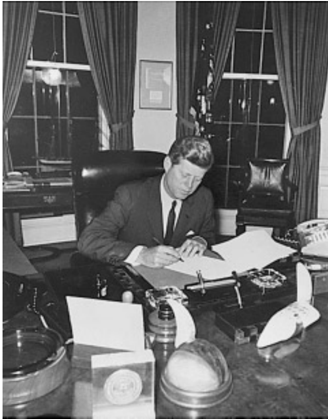
President John F. Kennedy signs the proclamation placing a quarantine around Cuba, in response to the Soviet deployment of ICBMs there, Oct. 23, 1962. The utopian faction in the military, and its civilian affiliates, tried unsuccessfully to goad Kennedy into a military strike against the Soviet missile sites and an invasion of Cuba.

overestimation of the Cuban population's propensity to rise up in revolt against Castro, the crucial element in the disaster was the calling off of the planned air strikes, for which Kennedy was blamed, but which was actually done by his National Security Adviser, McGeorge Bundy.