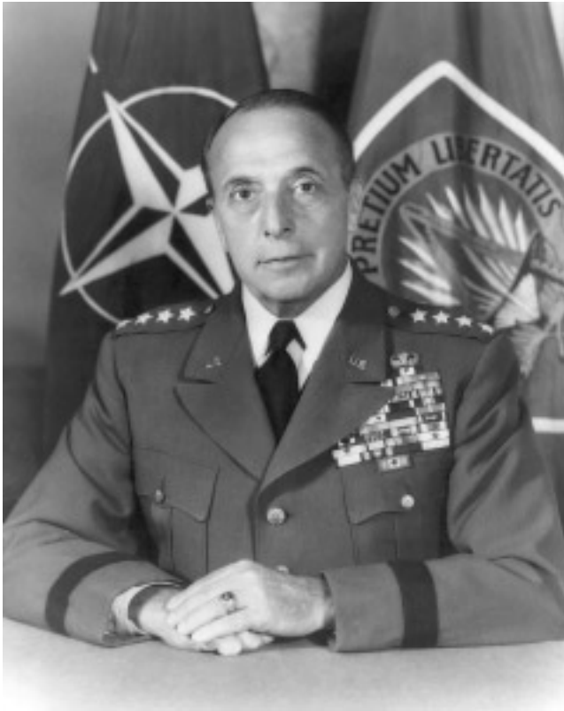
Gen. Lyman L. Lemnitzer was Chairman of the Joint Chiefs of Staff when “Operation Northwoods” was proposed (here he is shown in a later post, as NATO Supreme Allied Commander). The plan for the U.S. military to carry out acts of terrorism against the American population, to create a pretext for the invasion of Cuba, was circulated under his signature—but President Kennedy rejected it.