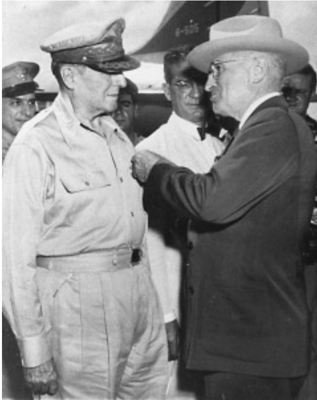
Gen. Douglas MacArthur, the greatest U.S. general of the 20th Century, was the foremost representative of the classically trained, anti-utopian faction in the U.S. military, who warned President Kennedy in July 1961 against getting involved in a land war in Asia. Here, he is being awarded a medal from President Truman in 1950—six months before Truman fired him, for opposition to U.S. policy in the Korean War.