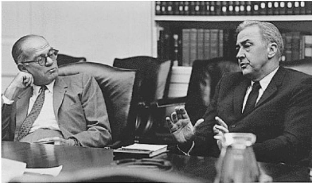
Sen. J. William Fulbright (left) warned in a July 1961 memorandum to Secretary of Defense Robert McNamara, that “extremely radical right-wing” speakers and/or materials from private organizations were circulating among the U.S. military, “with the probable net result of condemning foreign and domestic policies of the administration in the public mind.” Here, Fulbright is shown with Sen. Eugene McCarthy in 1966.