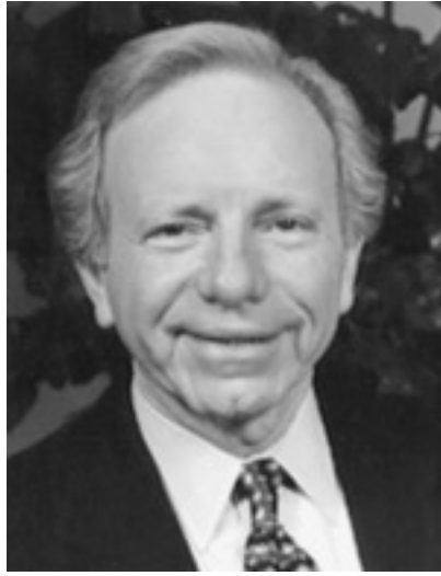
The obvious political partnership of Republican Senator John McCain (left) and Democratic Leadership Council Presidential choice Sen. Joe Lieberman (right) involves the President's "flight forward" on foreign policy, and the parties' paralysis on the U.S. economy.