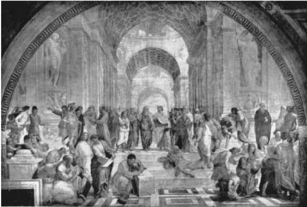
“All those among us, who have been privileged, as I have been, to develop and employ their cognitive powers as a mode for communion with the living thoughts of many among the greatest known souls from even millennia of mankind’s past, enjoy a special quality of life.” Raphael’s “The School of Athens” depicts generations of great thinkers, from Plato to the painter himself.

of the empiricists, among others. Take the case of Leonhard Euler’s fraudulent attack on Leibniz’s notion of an infinitesimal calculus, as an illustration of a display of utter incompetence by one among those otherwise classed as the most accomplished mathematicians. The same anti-scientific blunder by Euler and Lagrange, was the source of the blunder refuted by Gauss’ definition of the complex domain, in his fundamental theorem of algebra. Euler’s and Lagrange’s blunder, which has done great damage to legions of university students over two centuries, is the same fallacy on which Immanuel Kant, an adherent of the same anti-Leibniz network, based the entirety of his Critiques.