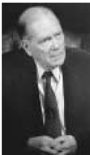
EIR Contributing Editor, Lyndon H. LaRouche, Jr.

gives subscribers online the same economic analysis that has made EIR one of the most valued publications for policymakers, and established LaRouche as the most authoritative economic forecaster in the world.