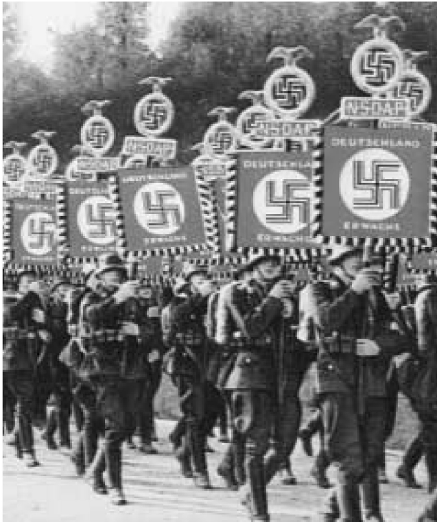
The Nazi Waffen-SS on the march. Today, the “utopian” advocates of a one-world empire, called “globalization,” have copied the methods of perpetual warfare from both the ancient Roman legions and the Waffen-SS.

President of the U.S.A., is what he is, and no more than that. His role must be taken into account, but excessive focus on his personality distracts attention from the powerful enemy “behind the throne” who is the real power behind the policies which the President is permitted to utter.