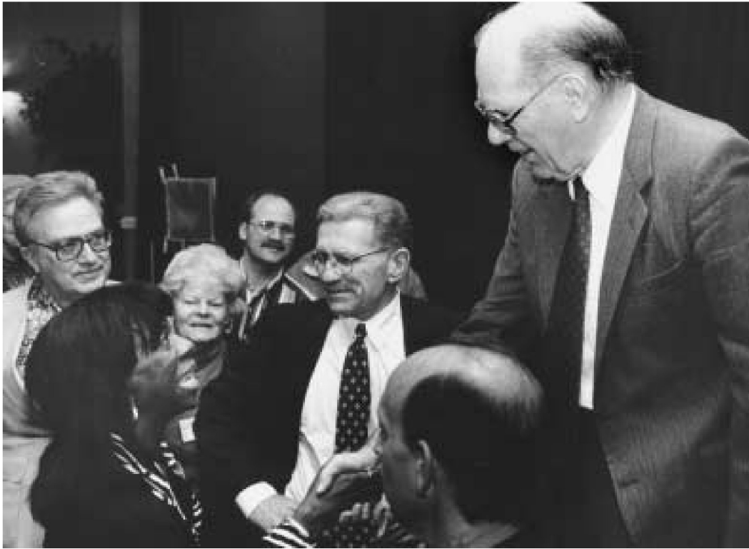
LaRouche: “There was never a case of an imperilled civilization which did not depend for its survival upon so-called ‘lone voices.’ ”

were key elements of this pact. Reality impelled the leaders of the U.S. Senate to violate part of that insane agreement, as a unilateral U.S. action.