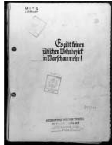
Left: Nazi SS troops guard Jews—including two women—captured in the suppression of the Warsaw Ghetto uprising of 1943. The original German caption reads: “These bandits offered armed resistance.” Right: The report of SS Maj. Gen. Jürgen Stroop, titled “The Jewish Quarter in Warsaw Is No More.”

war, or in a battle. And they have to be respected as that. They may be wrong, but if you capture them, or if they surrender, you treat them with the respect their position requires. No: Not true of this situation.