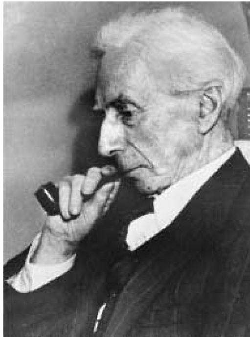
H.G. Wells (left) and Bertrand Russell, the Twentieth Century's most evil man. Racist beastliness began to take top-down control in the Western world, when their "one world government" circles introduced the utopian nuclear doctrine displayed at Hiroshima.

the set of specimens merely typified by Mussolini, Hitler, and Franco.