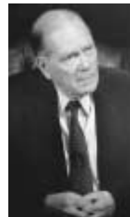
EIR Contributing Editor, Lyndon H. LaRouche, Jr.

gives subscribers online the same economic analysis that has made EIR one of the most valued publications for policymakers, and established LaRouche as the most authoritative economic forecaster in the world.