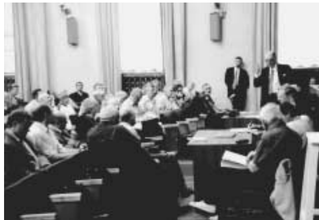
Lyndon LaRouche speaking to Russian Academy of Sciences in June 2001; a demonstration of catenary curves in LaRouche's newspaper, New Federalist. Dr. Enéas asks, "What Presidential candidate in Brazil, or in the United States, for that matter, has ever heard of a catenary? . . . None of them . . . has the slightest idea of the importance of scientific knowledge to the statesman who would lead a nation."

Mr. LaRouche has been insisting for decades, and I have been repeating here in Brazil since 1989, the crisis is systemic.