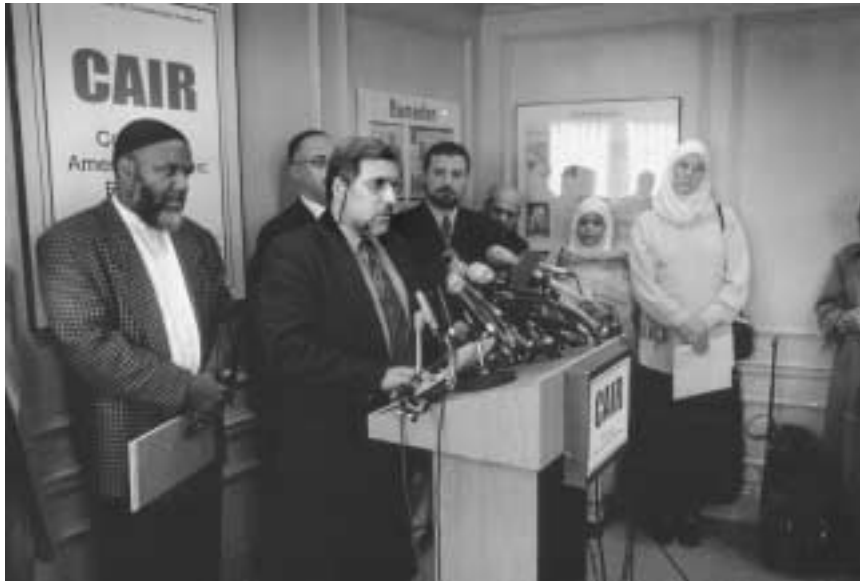
A press conference by the Committee on American Islamic Relations (CAIR), in March 2002, protested the Justice Department raids on homes and businesses of Arab-Americans, including the International Institute of Islamic Thought in Herndon, Virginia. Those raids were just the beginning of what Lieberman, Cheney, et al. have in mind to further the Clash of Civilizations.