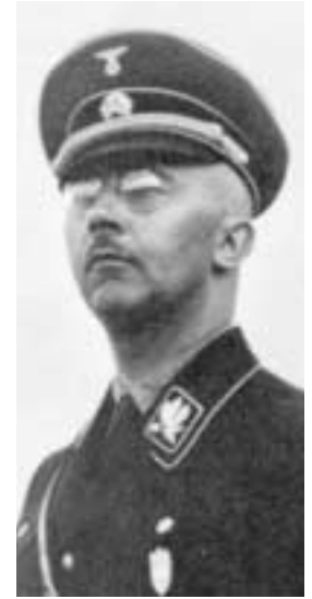
Joseph Lieberman and Lynne Cheney are leading a witch-hunt against Arab and Muslim intellectuals—or against anybody who defies the official line on 9/11—in the evil tradition of Sen. Joe McCarthy and Nazi SS Chief Heinrich Himmler.