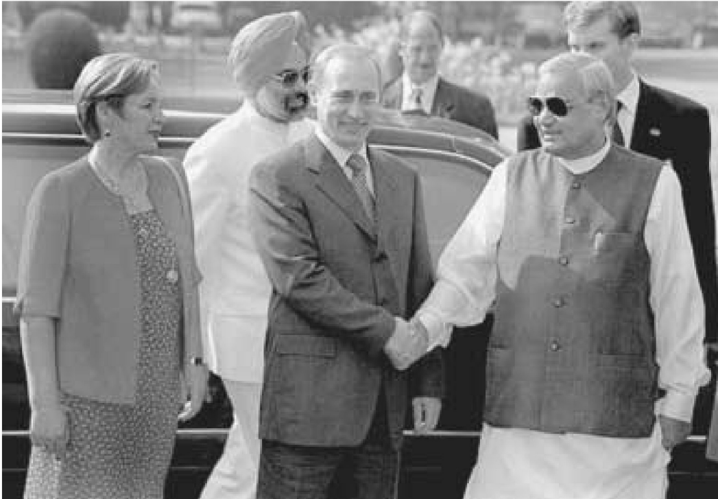
The presently emerging “Strategic Triangle” was first proposed by LaRouche in August 1998. Here, Russian President Vladimir Putin (center) meets with Indian Prime Minister Atal Bihari Vajpayee in New Delhi, during a December 2002 tour that also took him to Beijing.

together with certain reforms that must be made in terms of regional and international monetary-systems arrangements. But under those conditions, if Europe enters into what I’ve called a New Bretton Woods style of agreement, replacing the present monetary system, in that case, then the area of Russia, China, India, and their adjoining nations, will become the greatest market on this planet, for the long term, for a period of a quarter-century to a half-century. These areas of the world, which have some high technology — as China does, obviously, India does, and so forth — can not meet their internal needs, by their own high-technology capacity at this time. China, for example, must move from its characteristics of the past, as a coastal economy, a coastal-region economy, to develop the interior of China. This means large-scale infrastructure, it means water systems, it means new cities, it means all kinds of development. It’s a large area. China can not exist without developing this so-called “internal market,” for its continued economic life.