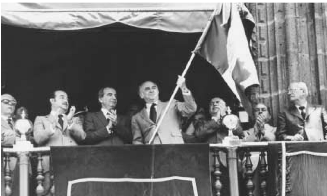
Mexican President José López Portillo on Sept. 3, 1982, after his nationalization of the banks. LaRouche's "Operation Juárez" plan for Ibero-American economic integration was on the agenda, until continental support for López Portillo's initiatives was blocked by Henry Kissinger.

denominate it, without making it negotiable, and use it in a central facility as a credit-basis for creating expanded investments in the hemisphere.