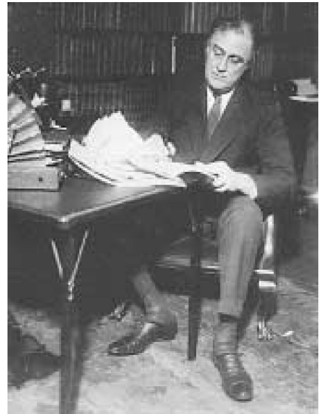
The U.S. Presidency is a wonderful institution, unique among the world's governments. Left to right: Benjamin Franklin (never President, but a genius who shaped the institution of the Presidency), Abraham Lincoln, and Franklin D. Roosevelt.

done — on several occasions, I've done several very important things of strategic significance, as a private citizen, in conjunction with circles in the permanent government. So, a lot of us are in this orbit, of being part of the Presidency, or being assets of the Presidency, and we generally work together, or fight each other. But when we are united, we can generally get a President of the United States to come to a fairly reasonable decision.