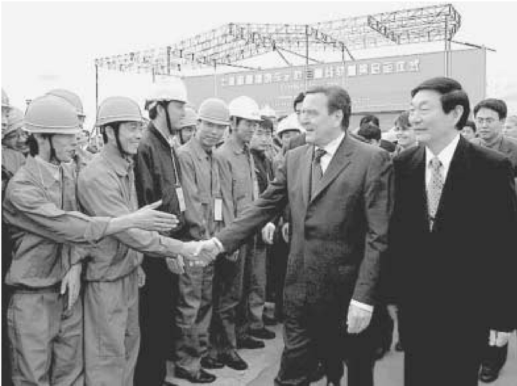
The courageous stand taken by German Chancellor Gerhard Schröder against an Iraq war helped to block the Utopians' "clash of civilizations" policy. Here, Schröder (left) visits the construction site of a Transrapid maglev train in Shanghai in February 2001. With him is Chinese Prime Minister Zhu Rongji.

pire. This was the reason for geopolitics as it was launched towards the end of the 19th Century and during the course of the 20th Century.