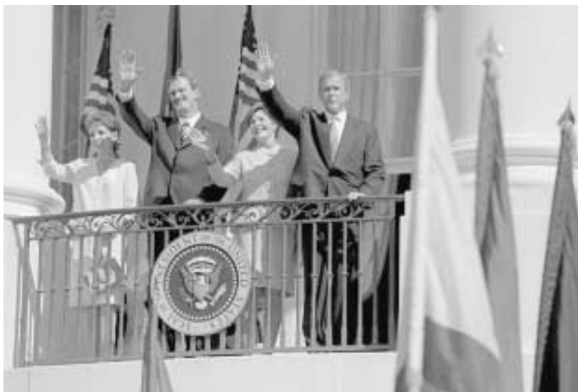
Mexican President Vicente Fox with his "amigo" George W. Bush, during a visit to the United States. Fox foolishly hitched Mexico's wagon to the bankrupt U.S. economy—and now the Wall Street crowd is demanding the full deregulation of Mexico's energy sector.

Over the course of September, Fox's team has prepared the requisite legislation for the energy reforms, and his top operators have begun to wheel and deal to get a faction of the opposition PRI party to back his own PAN, in order to approve the reforms. But the real hard-ball tactics are being orches-