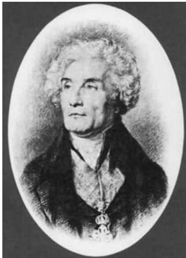
Synarchist financiers' fascism in its forms of the last two centuries begins with Joseph de Maistre, ally of British Lord Shelburne's manipulation of the Jacobin French Revolution and of Napoleon. The Dionysian "beast-man" as the imperial fascist leader was the modern invention of Maistre, whose "Martinist" cult shaped Jacobinism and the rise of Napoleon.