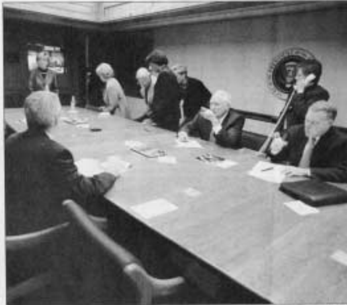
Minutes after the Sept. 11, 2001, attack, Vice President Cheney was in the operations center with his chief of staff, I. Lewis Libby, far right, national security adviser Condoleezza Rice, center left, and his wife, Lynne Cheney, far left.

Cheney's staff also waged a campaign to include the allegation in Secretary of State Colin L. Powell's speech to the United Nations in February in which he made the administration's case for war against Iraq. Cheney's chief of staff, I. Lewis "Scooter" Libby,