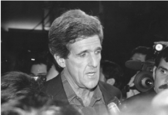
LaRouche (right) writes that Sen. John Kerry, by playing “me too” with Bush, both on the crucial questions of war and peace in Southwest Asia, and on the economy, will lose, disastrously rejecting the legacy on both foreign and economic policy of Franklin Delano Roosevelt (below right, meeting Saudi Arabia’s King Ibn Saud in Egypt in 1945). “My duty,” LaRouche says, “is either to replace Senator Kerry as presumptive nominee, or to create a situation in which he is impelled to become both a winning, and an actually qualified candidate as Bush’s replacement.”