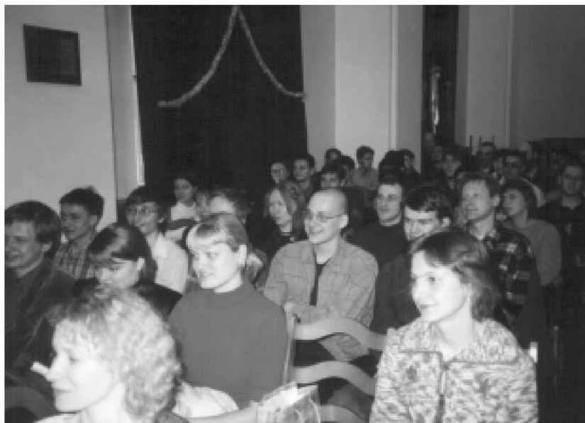
The audience at Moscow State University. "When you're gripped by an idea that you want to master," LaRouche told them, "you can move the world forward, in terms of ideas, as very few people in older generations can still do!"

As many of you know, the work of Vernadsky dealt with