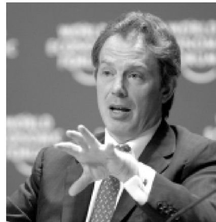
The United States is presently playing a catastrophic role, under Dick Cheney's puppet George W. Bush, Jr. and his ally Tony Blair (lower right)—the role of a grotesquely failed attempt at creating a global, Anglo-American caricature of the Roman Empire. But the snarling Dick Cheney on Lynne Cheney's (lower left) leash is no self-made man; think something more along the lines of Mrs. Mary Wollstonecraft Shelley's lurching Frankenstein Monster.

of the Adolf Hitler regime. We emphasized there, that the present U.S. Administration under Vice President Cheney's domination, is a modern echo of the consummately evil Count Joseph de Maistre's favorite Satanic figure, the inhuman Grand Inquisitor Tomás de Torquemada: the same Mephistophelean Grand Inquisitor implicitly, aptly, insightfully depicted by Fyodor Dostoyevsky's characterization. 1