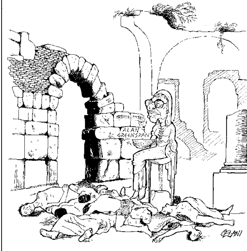
Lyndon LaRouche's new political action committee is campaigning to shift the disastrous policy axioms which have plunged the country into economic crisis. Here, an image of one of the culprits responsible for the mess, commissioned by LaRouche.

9/11, attended many events and receptions, where he was sought out by convention participants for intense discussions about the administration's war on terrorism. Former U.S. Ambassador to Iraq and Africa, Joseph Wilson, delivered a powerful indictment of the Bush Administration, in discussing how he investigated, and found false, the charges that Iraq had purchased uranium from the African country of Niger. Wilson also described how the Bush Administration sought revenge against him for countering its Iraq "intelligence," and exposed the name and job of his wife, a CIA covert agent, through leaks to reporters.