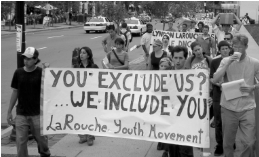
LaRouche Youth on the march in downtown Boston during the Democratic Party convention. The LaRouche Youth Movement distributed 50,000 copies of the LaRouche Platform at the Convention and throughout the city, dramatically changing the face of politics.

porter during the convention, LaRouche wrote, “I am the only person with first-hand competence in the crucial subject of economic policy, as the presently onrushing crisis defines the significant concepts of economic policy.