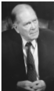
EIR Contributing Editor, Lyndon H. LaRouche, Jr.

gives subscribers online the same economic analysis that has made EIR one of the most valued publications for policymakers, and established LaRouche as the most authoritative economic forecaster in the world.