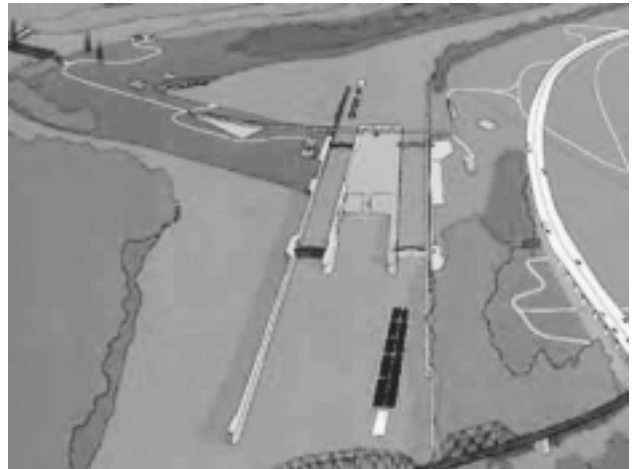
Shown in the photo at left looking down the Ohio River at Louisville, the Army Corps of Engineers' long-stalled plan to replace the old 600-foot McAlpine Lock (at right center of the photo), with a modern 1,200-foot lock (excavation, center), was delayed so long by funding cuts, that metal fatigue in the old lock's wall forced emergency closure of the Ohio River since mid-August. On the right is a schematic of the new lock, this time looking upstream. Nationally, neglect of water infrastructure is "close to catastrophe," says the Army Corps' director.

37 dams and locks on a 1,200 river-mile system—are even in worse shape than those of the Ohio. Refurbishing has been discussed, studied, and defended for more than 15 years, without getting Congressional approval. A get-started measure is now before Congress, but no action is assured ( Figure 2 ).