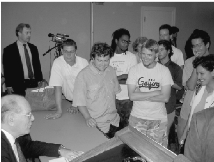
Lyndon LaRouche with organizers from the LaRouche Youth Movement (LYM), in Boston on July 28. The LYM deployed a team back to Boston after the Democratic Convention, to organize on John Kerry's home turf.

of the Monday demonstrations that freed East Germany from the East German regime, because the issue is similar. The issue is over the so-called Hartz IV program of austerity, which is a Nazi-like austerity program—actually, a Schachtian type of austerity program—sponsored by a number of people, including the Economics Minister in the present government of Germany.