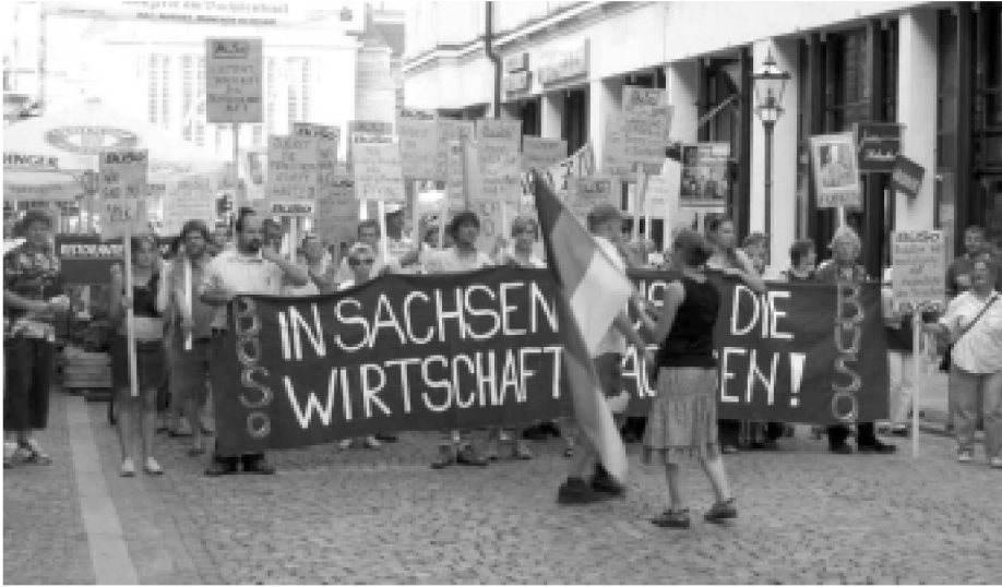
The LaRouche Youth Movement, with its banner reading “Economic Growth Must Start in Saxony!” at a Monday Demonstration in Leipzig, Germany, on Aug. 9. The tempo of protests against the government’s Hartz IV austerity program is growing rapidly, with leadership from Helga Zepp-LaRouche.

cally, but they didn’t raise them well morally. We were under the influence of a moral degeneration, typified by the Congress for Cultural Freedom, which was a corruption operation.