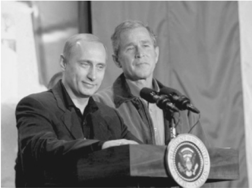
Presidents Putin and Bush in Crawford, Texas. Putin has made the terrible blunder of thinking that a four-way great-power division of control over raw-material resources can succeed in superseding the existing financial-economic order.

volves the raw materials (minerals, including oil) of South America, Africa, Northern and Southwestern Asia, and China. There is an emerging bloc between Western Continental Europe and Russia, a distinct role by China, and the U.S. faction.