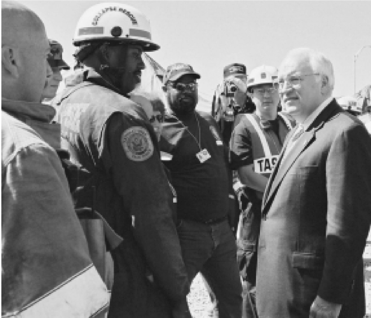
Vice President Dick Cheney with rescue workers at the Pentagon on Sept. 16, 2001. "Cheney himself probably shuddered in stark fear at discovering what his secret masters had done on fateful Sept. 11, 2001, and is probably shuddering still, to the present moment. Since then, to the present day, that recurring, haunted man's shudder, is probably the most honest thing about the otherwise essentially dishonest Cheney."

ments under which the majority of the population is degraded to the status of human cattle, such as the herded human cattle of Quesnay's code of " laissez-faire " and Adam Smith's "free trade," or the hunted cattle of Brzezinski crony Samuel P. Huntington's target, Islam. The collateral form of the oppressor of mankind has been the reigning oligarchy. Since ancient imperial Rome, the leading expression of that abomination known as financier-oligarchy has been Venice and Venice's clone and successor, the Anglo-Dutch Liberal system of predatory usury. Among the latter, neo-Venetian Liberals, the most feared and hated adversary of financier-oligarchical power, has been the American System of political-economy as associated with the work of U.S. Treasury Secretary Alexander Hamilton, the latter the foe of the treasonous Aaron Burr, of the Bank of Manhattan, who was himself an intelligence asset of the British Foreign Office secret committee head Jeremy Bentham.