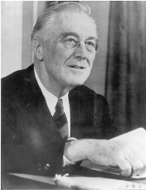
President Franklin D. Roosevelt—and his funeral procession in Washington, D.C. in 1945. LaRouche, then stationed in India, was asked by GIs what the President’s death meant. “My reply was that I did not know, but that I was greatly worried by the replacement of a great President by such a little man.”