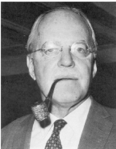
President Harry Truman (below) and his CIA director Allen Dulles. LaRouche reports that with Truman’s installation as President after the death of Roosevelt, the United States turned to the right, “as typified by Allen Dulles’ bringing a section of the Nazi SS apparatus into what became that Nazi element of the Gladio secret system in Italy. . . .”