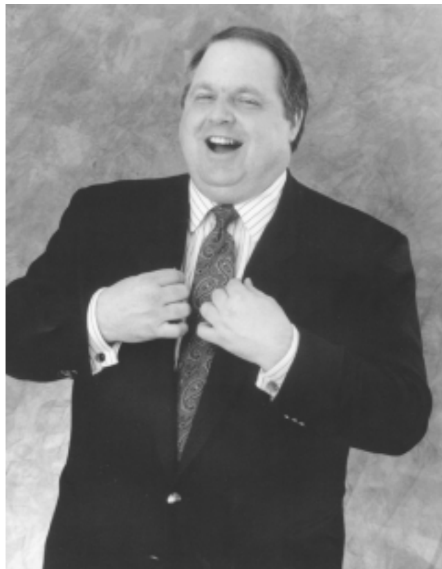
Rush Limbaugh, one of the “Great Backlash” moralists who tell people that it’s in their own interest to support “American” policies—that just happen to make the rich richer and the poor poorer.

This conservative movement presented Kansans with a phony alternative to their perceived impotence in the face of the changes after 1968, giving them “an attractive and even a