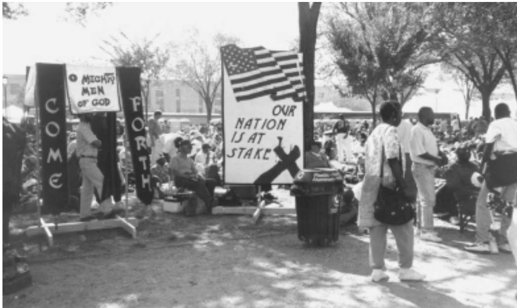
Forget the economy, the corporate conservatives tell the “little people”; it’s all about “values.” Here, a Promise Keepers Rally in Washington, D.C. in 1997.

1945 to 1968, the conservatives changed their tactics, shifting away from direct confrontation over economic issues, to so-called cultural issues. This sleight-of-hand has worked, spectacularly, as the “little people” have embraced those who are now profiting at their expense.