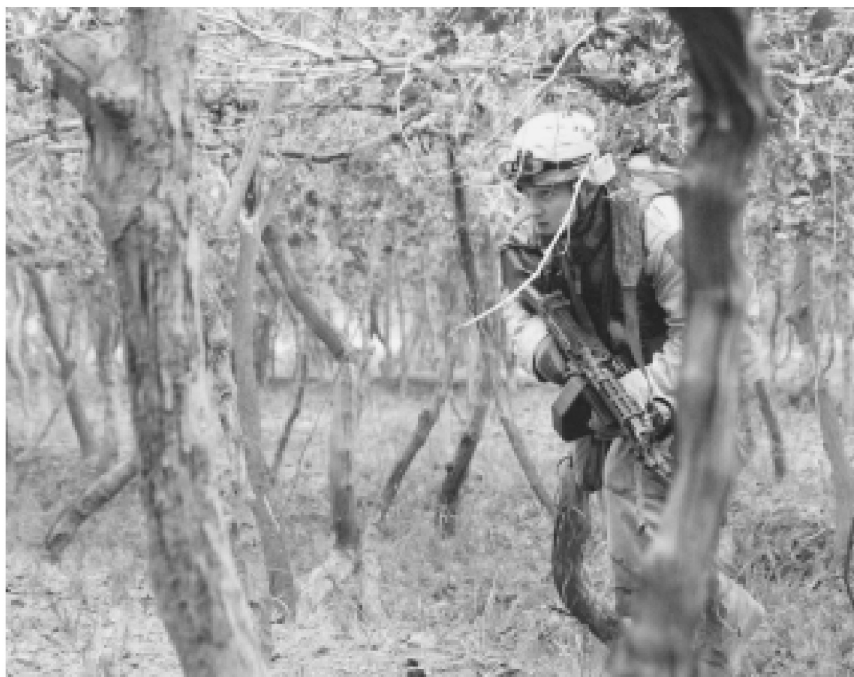
Iraq: "If we don't get out of this war quickly, which we never should have gotten into, we're not going to have a U.S. military anymore." Here, an American soldier searches for a weapons cache near Buhriz.

And the way they thought they were going to do it was to go back to what some people thought back in 1945, '46, '47, when they thought that the use of nuclear weapons, when we had a monopoly on them, that we could intimidate the Soviets and others, and we could establish a world government. We'd turn the United Nations into a system of world government in which sovereign nations would no longer really exist. They'd be simply local departments of a world government. But then came the Korean War, and simultaneously the discovery that the Soviet Union had developed a thermonuclear weapon which was already operational, and we didn't have one yet. So, they called off preventive nuclear warfare, for