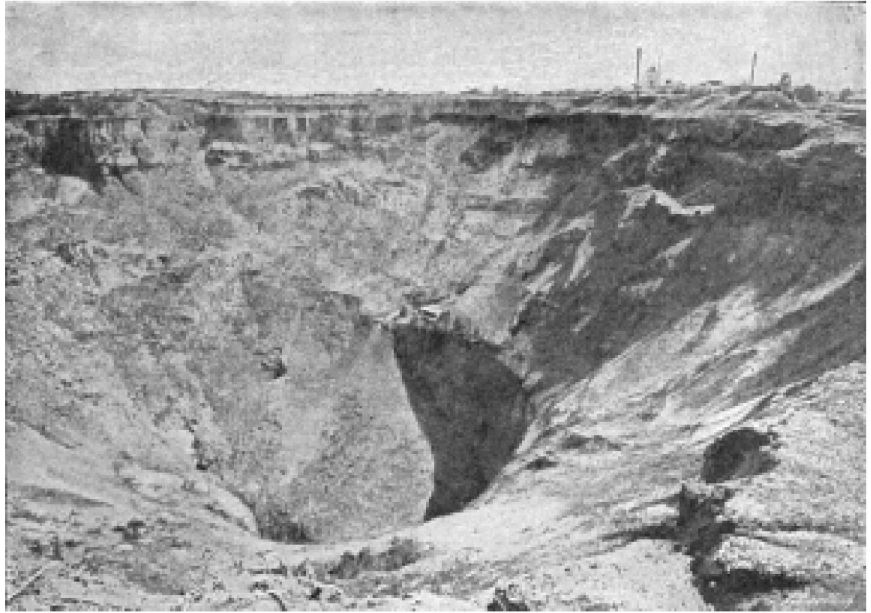
"One of the central features of conflict in the world today, is a fight for financial control over raw materials," LaRouche said, as the "smart predatory money" tries "to grab as much as possible of the future raw material resources of the world." Here, a mine in South Africa.

Now, for some time I've been on this case, back to the 1980s, for example, in particular, when I was pushing the Reagan Administration to adopt the SDI, which it did do. And as a part of that, one of the things that I was doing in my negotiations with the Soviet government on behalf of the Reagan Administration, was to propose this kind of arrangement. I said, let's get rid of this immediate threat of a thermonuclear confrontation. Let's do this by getting other nations to agree with us—and I did find a lot of agreement in Italy, Germany, France, and so forth on this—why not propose that we consolidate, scientifically, the technologies needed to develop systems which are superior to any kind of system which we have now, but which we know exist and can be developed, in order to intercept missiles of this type, in such a way that we can prevent anyone from winning a war by the use of thermonuclear ballistic-missile barrage? And use that technology which we develop for this particular purpose, and use it immediately for many other purposes, to improve the economy of the nations of the world, and share this technology with people.