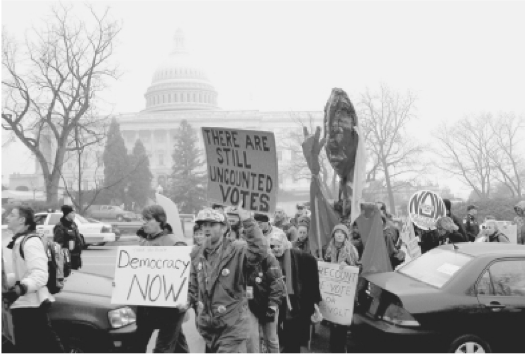
Progressive Democrats of America march on Capitol Hill on Jan. 6, calling for the certification of the Presidential election to be blocked. "Vote suppression," LaRouche said, is "a violation of our Constitution. . . . It's a Federal crime, but a lot of Republican agents did it."

of the water flow of the Nile north, you're going to have hell in Egypt, and that hell is going to spread throughout the region. So don't play games with that area of the world in that way, either.