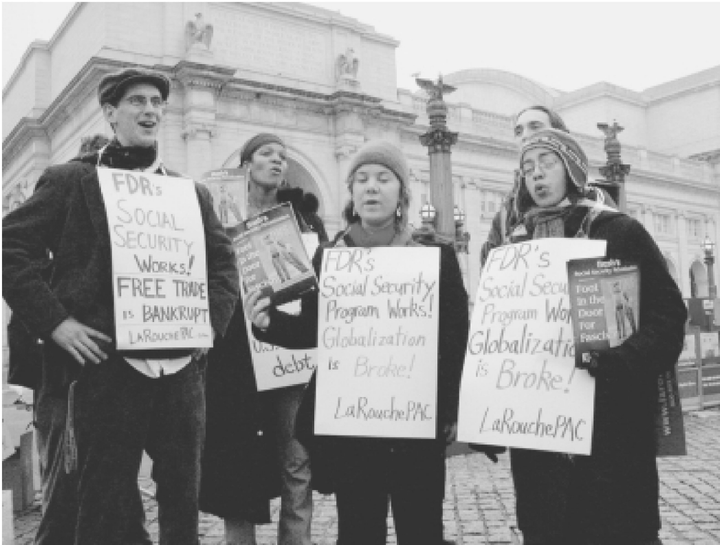
One of the LaRouche Youth Movement organizing teams in the nation's capital, to protect Social Security from the Bush Administration's privatized rape, on behalf of Wall Street.

And then, when the Treaty of Westphalia was signed, which established modern international law and civilized behavior among nations (at least those of Europe), the people of Germany, who had been the chief target of this war, rejoiced. And they rejoiced in the form of a hymn, named Jesu, meine Freude . Later, at the beginning of the 18th Century, a great man, Bach, re-set this hymn, which was already an established hymn, which celebrated the relief of mankind from this terrible century-long, more than century-long, epoch of religious warfare.