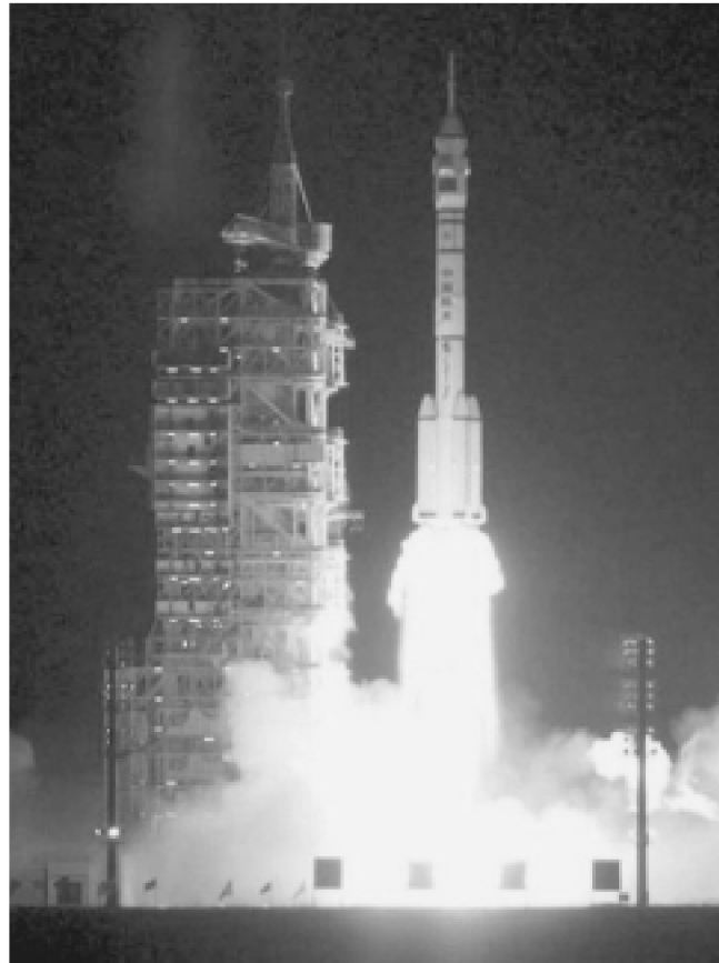
The space program has to be part of a new Treaty of Westphalia, uniting Western culture with the cultures of Asia, and guaranteeing raw materials for all, for the indefinite future, LaRouche said. Here, the liftoff of China's Shenzhou rocket.

This is one of the differences in the situation today from what it was, say, 50 years ago, or 100 years ago. We are now so expanded in terms of the advanced utilization and occupation of the planet, we can no longer assume there are frontiers that we can loot, like barbarians, indefinitely. We are taking over the planet, economically, physically, we're taking over more and more of it. But when you take over the entire territory, you don't have neighbors to loot. You've got to think about how you manage what you have. And so therefore, one of the common problems, the common interest