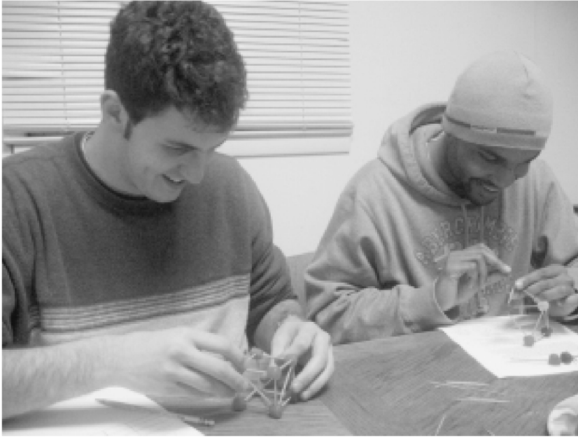
A LaRouche Youth Movement cadre school project in constructive geometry, in Cleveland, Ohio. "To be a human being is to be immortal. To be immortal by virtue of ideas, ideas comparable to those of valid ideas of physical science. To participate in continuing the transmission of these kinds of ideas, from previous generations, from previous experience of humanity."

drama, music, and so forth. These are essential, because it's by these methods of communication, associated with great artistic composition, that we are able to transmit ideas to one another, ideas of principle.