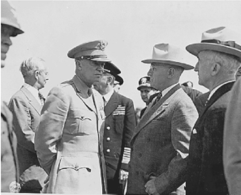
Gen. Dwight D. Eisenhower with President Harry S. Truman, July 15, 1945. When he became President, Eisenhower saved the country from some of the worst of Trumanism, because he was an American traditionalist.

the Nazis to power, was ruling in Europe, and in the United States, too. This was a right-wing turn, which I recognized already, coming back in '46. That the right wing had taken over! And the so-called anti-Soviet campaign was a part of a right-wing movement, not something caused by Joe Stalin, who was a pragmatist. Not something that would have happened under Roosevelt. But happened under Churchill and Truman, and those who controlled and owned Truman.