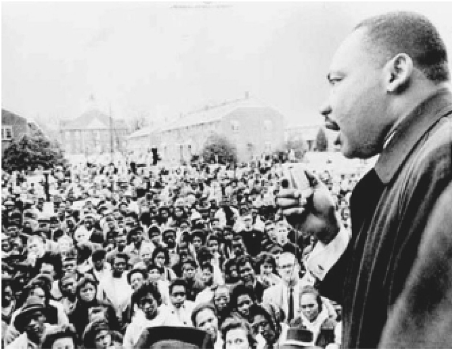
Dr. Martin Luther King, Jr. addressing supporters in Selma, Alabama. After King's assassination, his successors were not up to the tasks of leadership, and the civil rights movement degenerated. That change "led into the demoralization, the decadence, the disgusting decadence, of the culture of the United States up to this point."

education in New York City. What happened then, after Martin had been killed, is that the leaders who had been drawn into the civil rights movement, suddenly became thieves, determined to loot the education system of New York, in order to provide jobs and special grants for themselves. And they organized a strike, an attack, an attempted race riot, against the teachers of New York City.