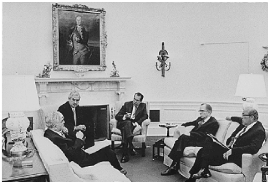
President Nixon meeting with Cabinet members on May 4, 1971, a few months before he killed the Bretton Woods system—on orders from George Shultz. Left to right: Arthur Burns, John Connally, Nixon, Paul McCracken, Shultz.

Therefore, I have unique qualifications. And I have, as long as I stick to my cause, I have my immortality. And when you have your sense of your immortality, you are undefeatable, as was Jeanne d’Arc; as we shall prove eventually, as was Martin Luther King. His trip to the mountaintop: He proved it. His work is immortal. He is immortal —where those flinched and went in the other direction, are not .