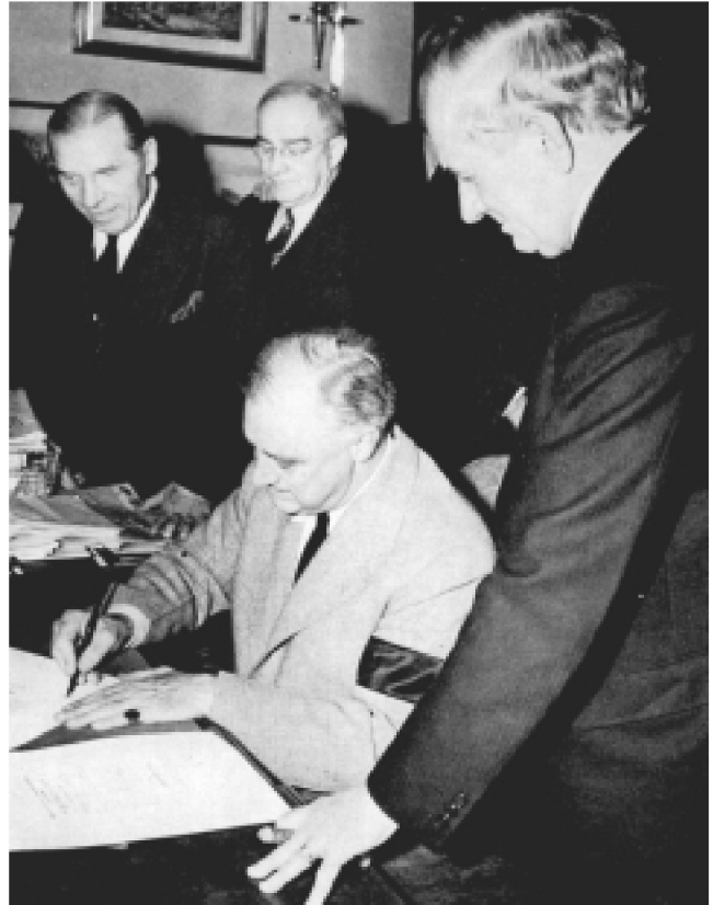
President Franklin D. Roosevelt signs the Declaration of War, Dec. 8, 1941. FDR saved the world, and saved the United States itself from fascism. If he hadn't acted as he did, "we'd been in Hell a long time ago."

We have pushed for the kind of leadership I knew we