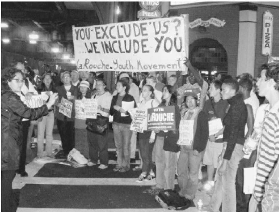
The LaRouche Youth Movement at the Democratic Party Convention in July 2004. The LYM's intervention was a turning point in the party, which had hitherto been flailing about, with a lackluster Presidential campaign. "I forced the situation," said LaRouche, "so that we were in a position of leadership within the Democratic Party, from the time of that convention onward. It worked!"

be done. I have lived my life—as I can say, looking backwards—I have lived my life for these days, these older days in my existence. This, in future history, will be acknowledged as the immortal purpose of my life: To save civilization. To provide a kind of leadership which can not be found, an ingredient of leadership anywhere on this planet, except in me. I have to do it.