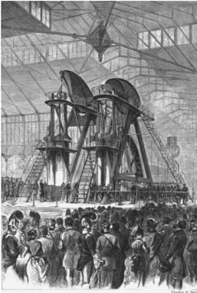
The American System of political-economy created the greatest industrial power the world had ever seen. Here, a Corliss engine at the 1876 U.S. Centennial Exhibition.

which ensure the desired result of the combined action of large institutions, including government, and individual free will. This is done by aid of the regulation of the circulation of money, regulation accomplished by means including the use of the power to set tariffs and to tax, or subsidize.