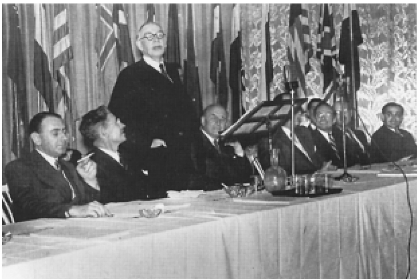
John Maynard Keynes addresses the Bretton Woods Conference July 4, 1944. Writes LaRouche: "The feasibility, and adoption of a turn to a fixed-exchange-rate system akin to the original Bretton Woods system, is indispensable for all nations, at this time. This requires a United States which has returned to the kind of internal and foreign policies associated with the intention of President Franklin Roosevelt's launching of the original Bretton Woods system."

report, is to take us beyond mere acknowledgment of what were, rightfully, the globally exceptional achievements of the American System of political-economy of Hamilton, Lincoln, and Franklin Roosevelt (among others). It is not sufficient to acknowledge the historically demonstrated superiority of those traditions. It is necessary to know the truth of those principles scientifically. This third point is the pivotal argument on which my attention is focussed here.