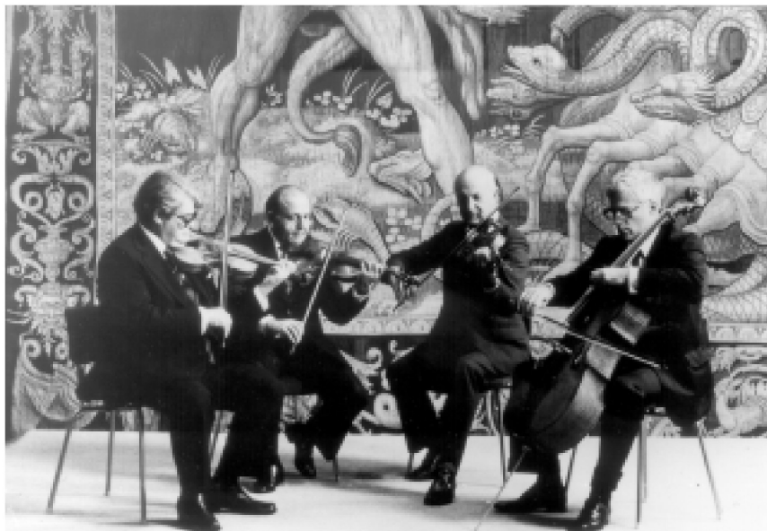
The celebrated Amadeus Quartet in performance. Their genius lay in playing together “between the notes,” bringing out the unity of the Classical composer’s idea.

The controlling influence over this subtlety, as expressed in an acceptable performance of a Classical work, is unity of