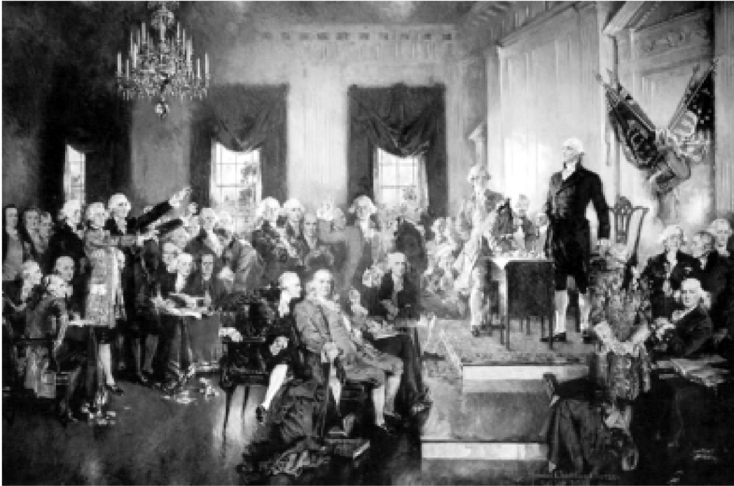
“The U.S.A. was built by Europeans.” The principles of the commonwealth and promoting the general welfare, affirmed by the Council of Florence (1431-1445), were the inspirations for the U.S. Declaration of Independence and the 1789 Federal Constitution, Here, George Washington presiding over the 1789 Constitutional Convention, as depicted by Howard Chandler Christy.