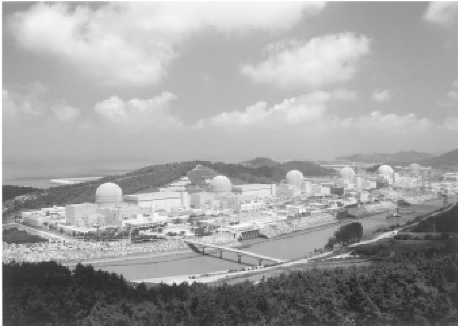
Korea Hydro & Nuclear Power Co., Ltd.

The Yongwang nuclear power complex in South Korea. “We can build nuclear plants, like pancakes! . . . There is absolutely no substitute for nuclear power, in any sane country in the world. You may use other kinds of power, but nuclear power is the only thing you’ve got that’s worth having.”