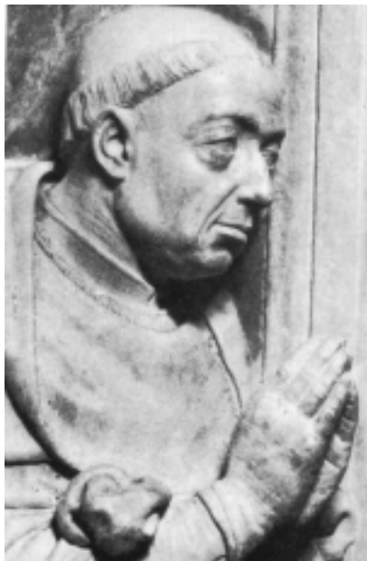
Nicholas of Cusa (1401-1464). He founded modern experimental science, reviving the method of the Pythagoreans and Plato. Zorzi attacked him directly.

As I have already emphasized, repeatedly, earlier in this