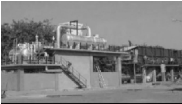
This 4,500-cubic-meters-per-day Multi-Stage Flash desalination plant is under construction, inside the nuclear facility at Kalpakkam, in Tamil Nadu state.

knowledge as the “Father of the Indian Missile Program.” Delivering the inaugural address at the Indian Nuclear Society conference at Kalpakkam, near Chennai, in 2003, President Kalam had stressed the need for finding a lasting solution to the water crisis around the world. He said on that occasion, that desalination of sea water to produce fresh water appears the best, with 97% of the Earth covered by ocean. This could produce a perennial supply of fresh water. The Indira Ghandi Center for Atomic Research is located in Kalpakkam.