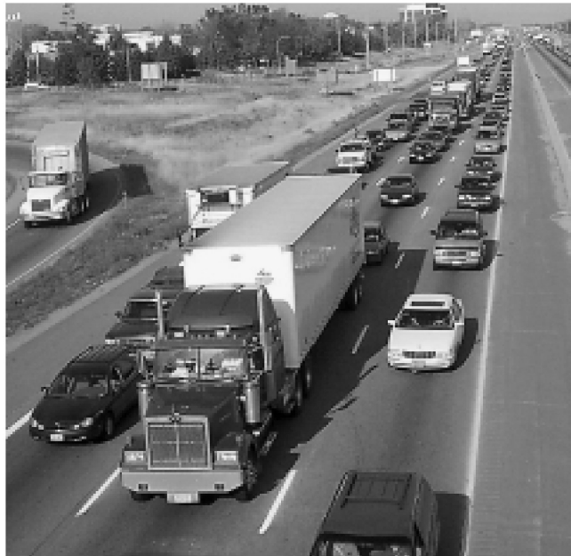
"About half of the total new investment in the U.S. economy should go into infrastructure," said LaRouche, to make the economy more productive. People spend hours per day commuting because of suburban sprawl; the over-concentration of what industry exists, in a small area; and the lack of rapid transit.

People don't recognize the economic significance of infrastructure for production. For example, let's take the question of a rail system, as opposed to a highway system. Now how many jobs do people have, and how many hours a day do they spend commuting among these jobs? When you don't have, for example, a high-speed rail system, or you don't have urban areas developed in a rational way so that people don't have to travel three or four hours a day to commute to and from work.