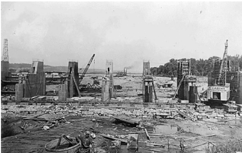
Franklin D. Roosevelt Library

But more important is, the basic FEMA capability is actually grafted onto the military Corps of Engineers. And it's the Corps of the Engineers that's been cut back. Therefore, what I would do, is to go to an 18-division strength, which was the 1989-1990 strength. That is to say, we don't have to activate for purposes of war as such. But we need the other function of the military, the military corps of engineers function. And in case of a war, or similar problem, it is generally the military