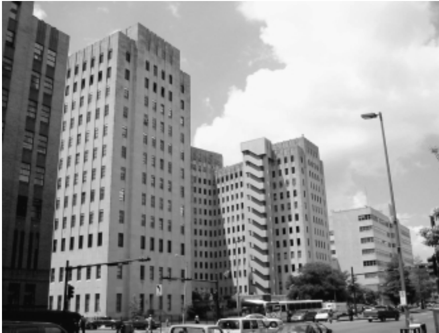
New Orleans' Charity Hospital, before Katrina struck. Adjoining it is the Tulane Health and Sciences Center of Tulane University. Today, only half of all hospitals in the city and surrounding counties are still open. Charity Hospital, which served the city's poor and uninsured, has been forced to relocate to a Lord & Taylor department store, because the hospital was so severely damaged.

leges, universities, and technical schools suffered between $500-600 million in damages, affecting tens of thousands of students. Whether to rebuild, what to rebuild, and where to rebuild are questions intertwined with repopulation and enrollment numbers, which in turn are dependent upon people's ability to rebuild.