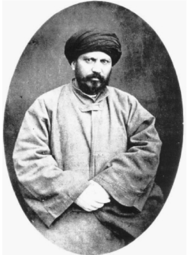
Jamal al-Din al-Afghani (1838-97) was a British puppet, and those who follow in his footsteps today are being used by British intelligence, including in the current fraudulent attacks on the Pope, "to bring Islam to self-destruction of its peoples from within."

This decadence spread within the Christian churches, including the Catholic Church, is typified by the accelerated shrinking of the clergy, through the combined effects of aging and death of the older ranks, and the lack of renewal of those ranks from younger volunteers. This decadence is also expressed, in appropriate forms, by the wild-eyed lunatic cults associated with the political base of increasingly demented U.S. President George W. Bush, Jr. Fewer and