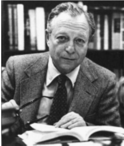
Irving Kristol, one of the original neo-cons, was the founder of the Collegiate Network that owns many campus newspapers, and is active in many of the groups profiled here.