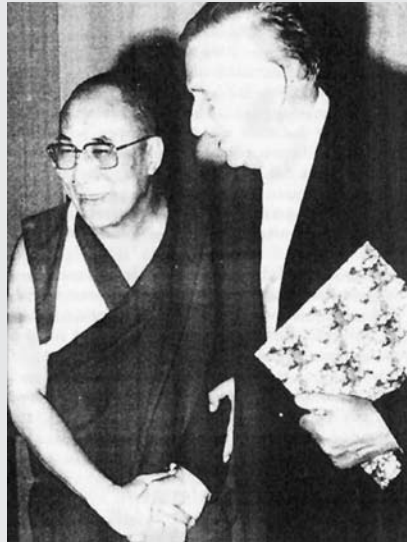
Clockwise, from top: The Dalai Lama (left) with SS officer Dr. Bruno Beger, a “race scientist,” who measured skulls and other body parts in Tibet (photo, lower left), and at the Auschwitz concentration camp; Heinrich Herrer (second from left), a member of the SA and SS, with Hitler (third from left), in Breslau, Poland, July 1938, wrote the book and film Seven Years in Tibet, which glorifies the Dalai Lama; the Tibetan guru is shown here with Miguel Serrano, head of the Nazi Party of Chile, in Santiago, 1992; the Dalai Lama with Shoko Asahara, leader of the AUM Shinrikyo cult in Japan, which released sarin gas in the Tokyo subway system in 1995, killing 12 people.