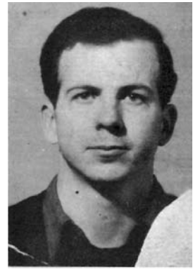
Lee Harvey Oswald