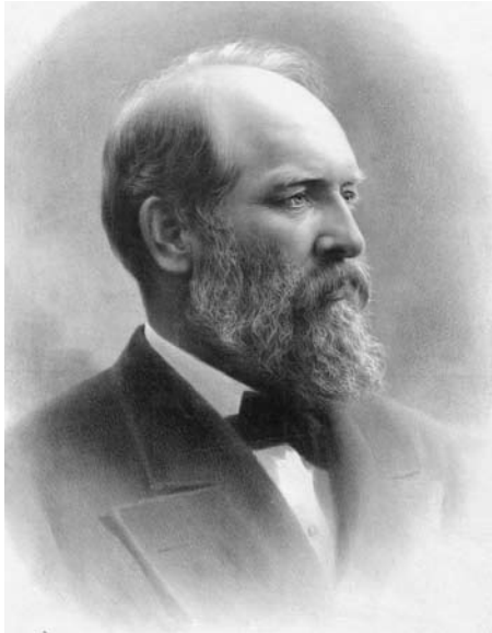
Library of Congress

President James Garfield (left) was murdered, in 1881, because he was waging a virtual war against the British Empire. His ally, James Blaine (below, left), warned Garfield against “the machine in New York,” run by banker August Belmont (below), a Rothschild lackey, and head of the Democratic Party.